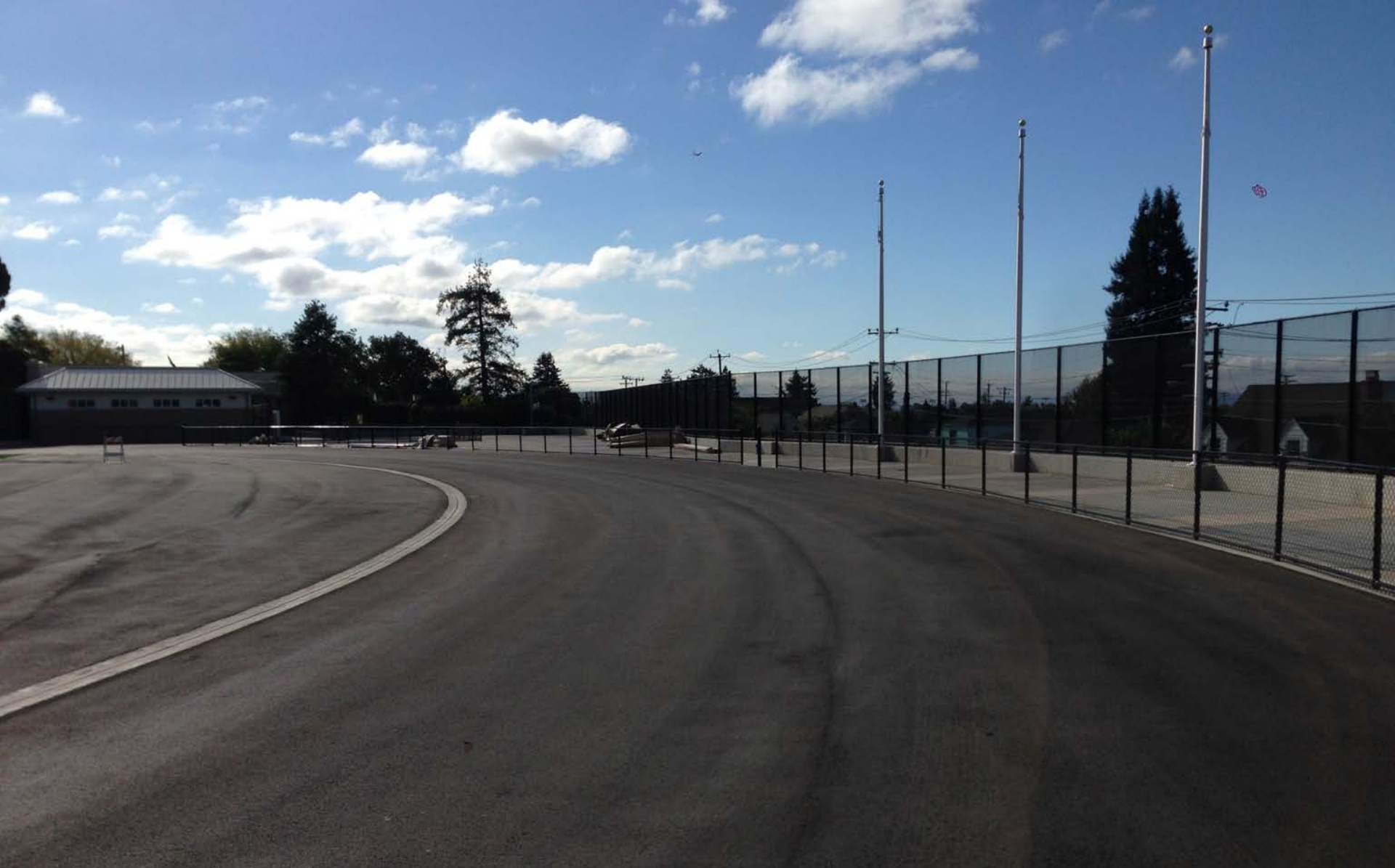
10.e. El Cerrito High School Stadium Track Surfacing