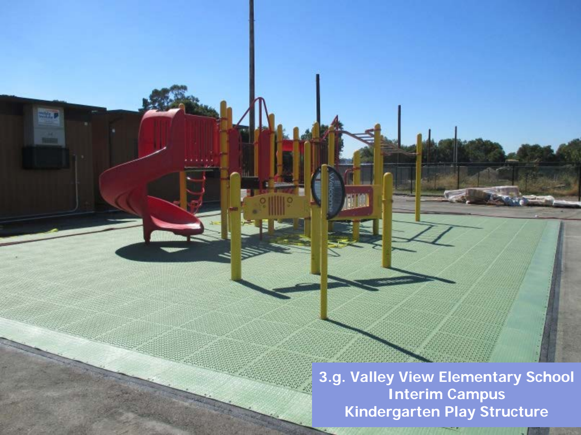
3.g. Valley View Elementary School Interim Campus Kindergarten Play Structure