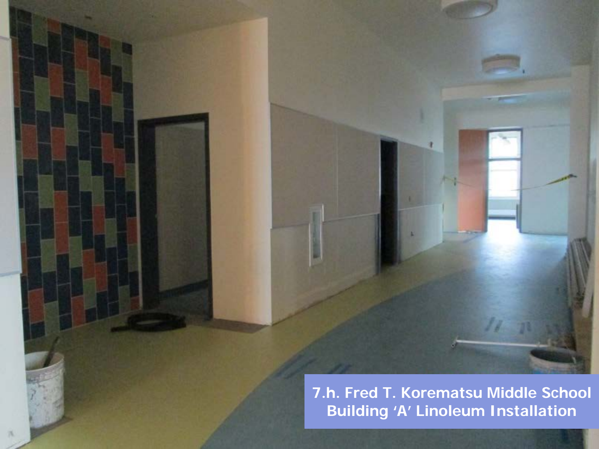
7.h. Fred T. Korematsu Middle School Building 'A' Linoleum Installation