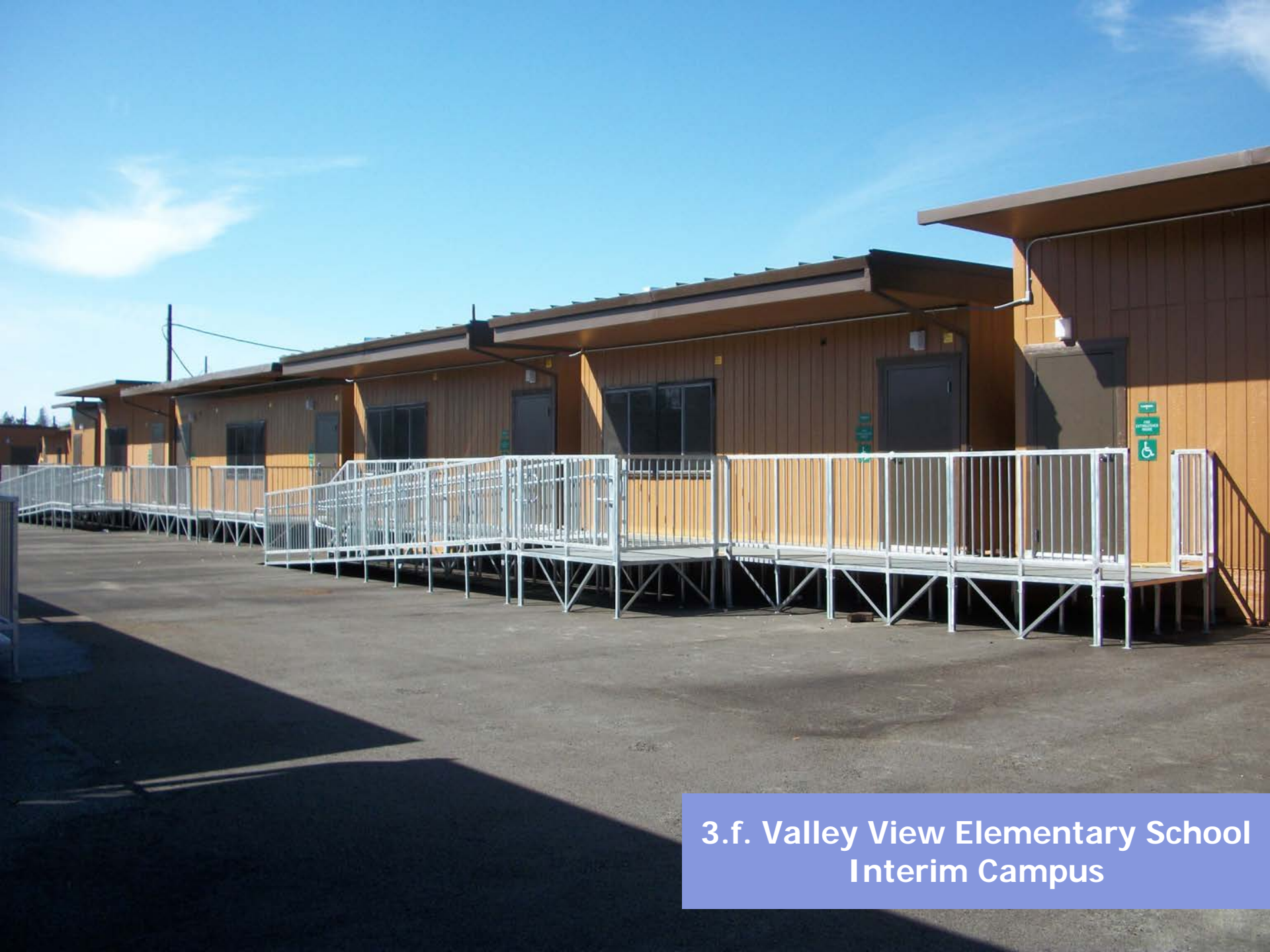
3.f. Valley View Elementary School Interim Campus