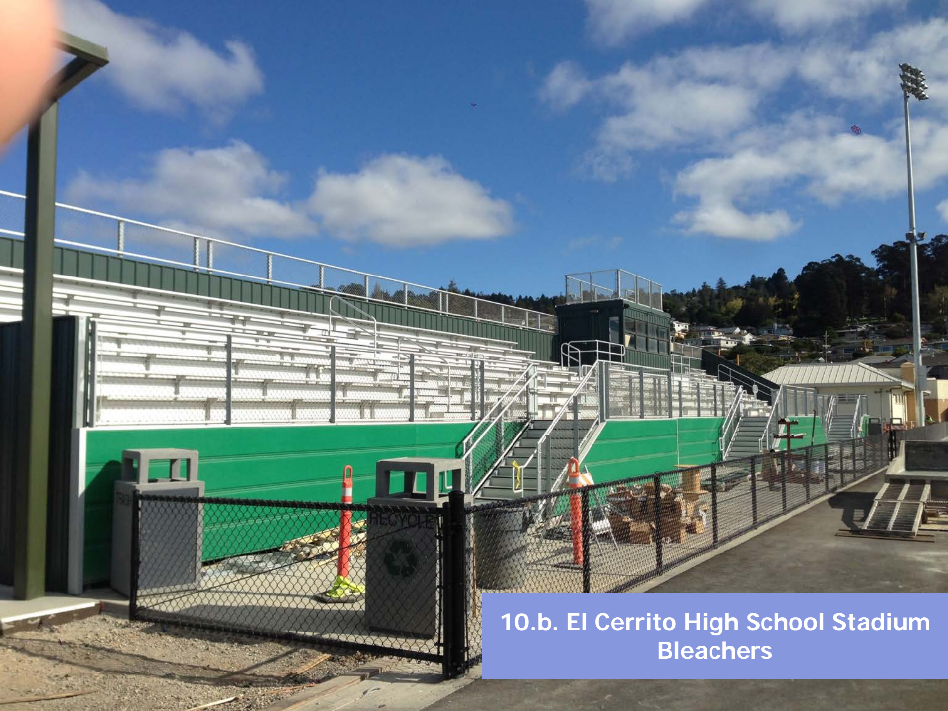
10.b. El Cerrito High School Stadium Bleachers