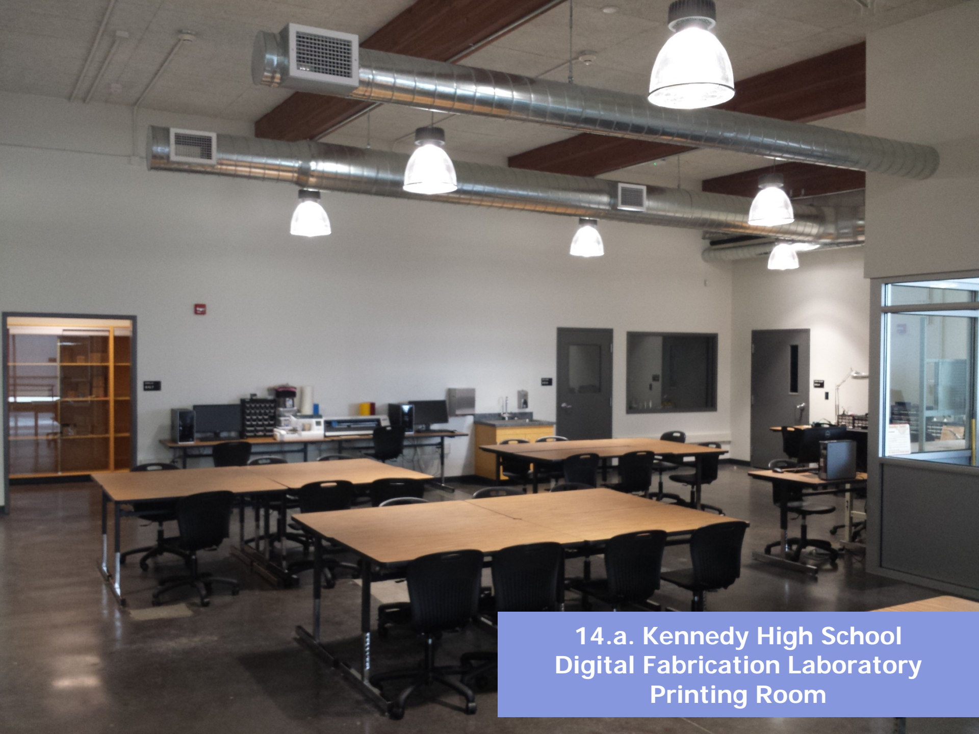
14.a. Kennedy High School Digital Fabrication Laboratory Printing Room