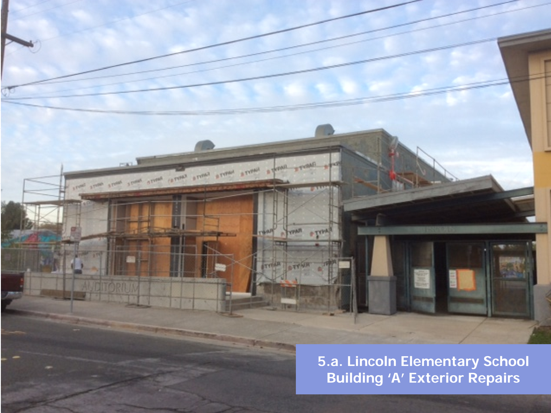
5.a. Lincoln Elementary School Building 'A' Exterior Repairs