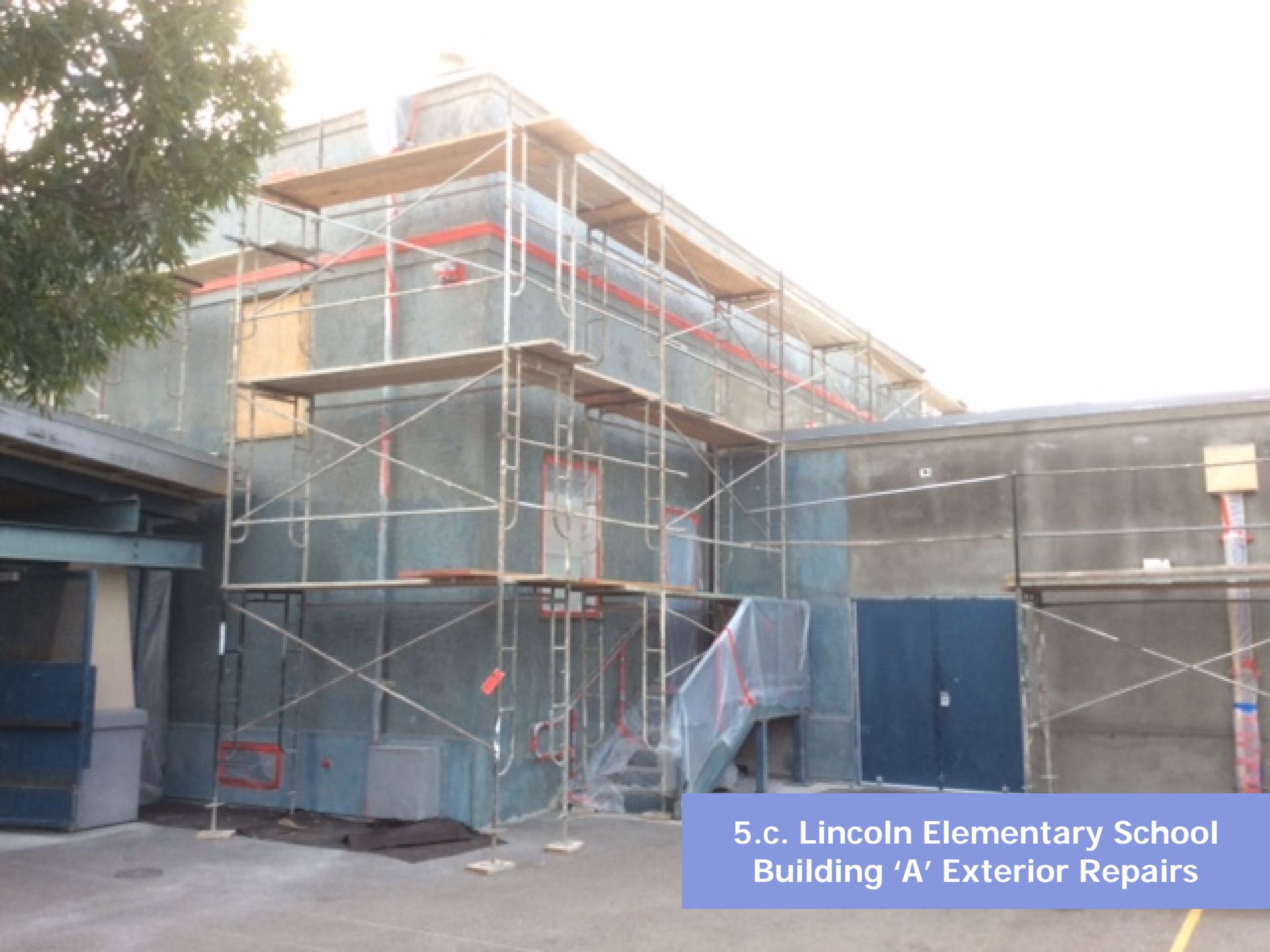
5.c. Lincoln Elementary School Building 'A' Exterior Repairs