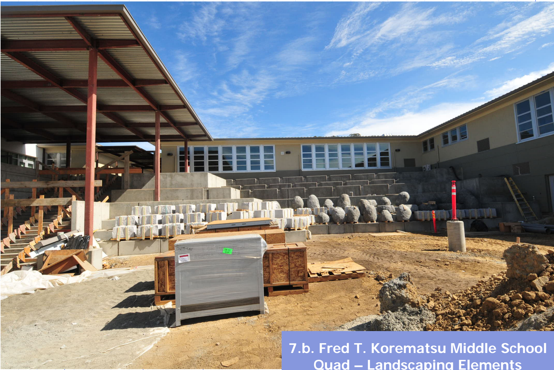
7.b. Fred T. Korematsu Middle School Quad – Landscaping Elements