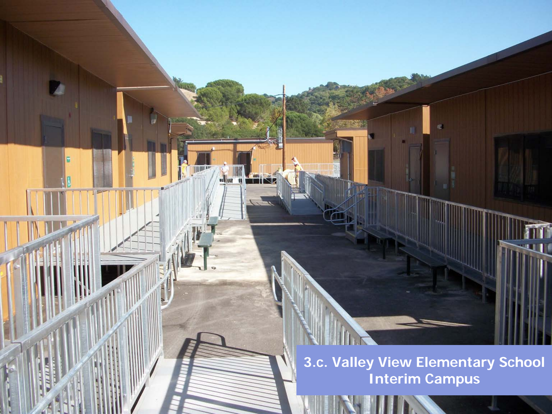
3.c. Valley View Elementary School Interim Campus