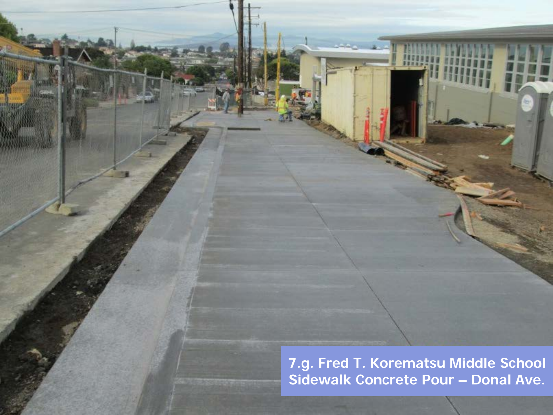
7.g. Fred T. Korematsu Middle School Sidewalk Concrete Pour – Donal Ave.