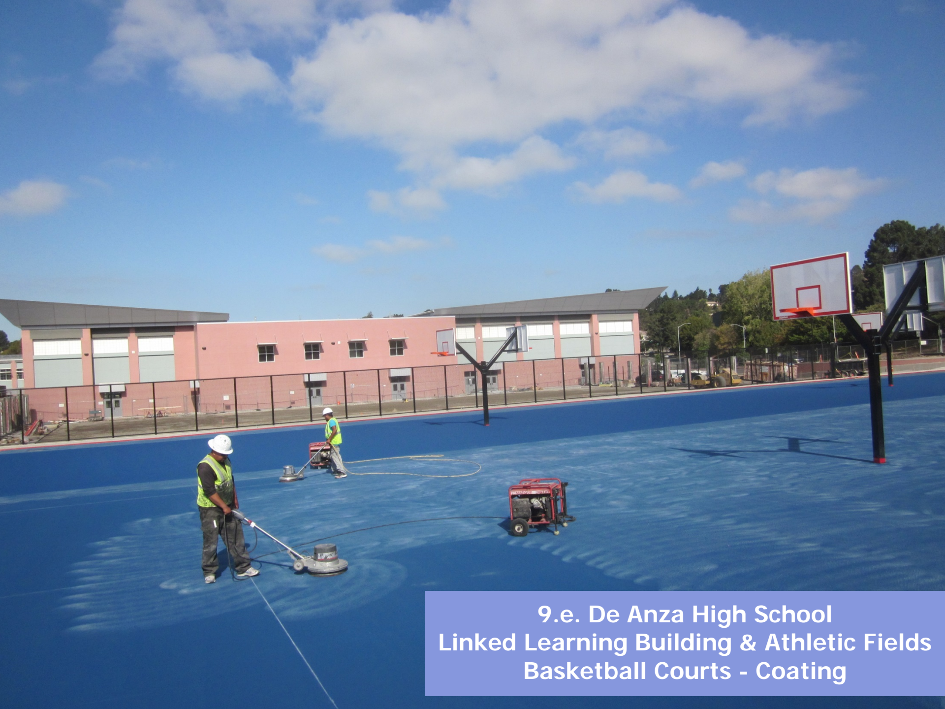
9.e. De Anza High School Linked Learning Building & Athletic Fields Basketball Courts - Coating