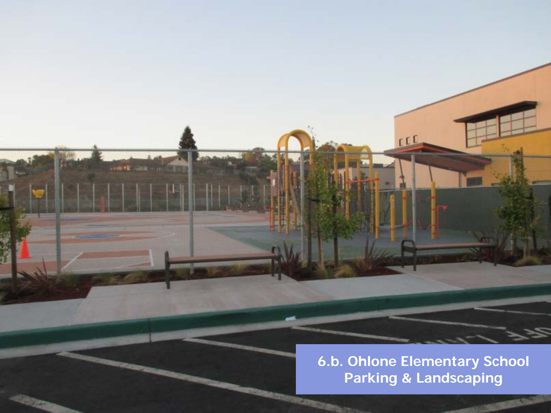
6.b. Ohlone Elementary School Parking & Landscaping