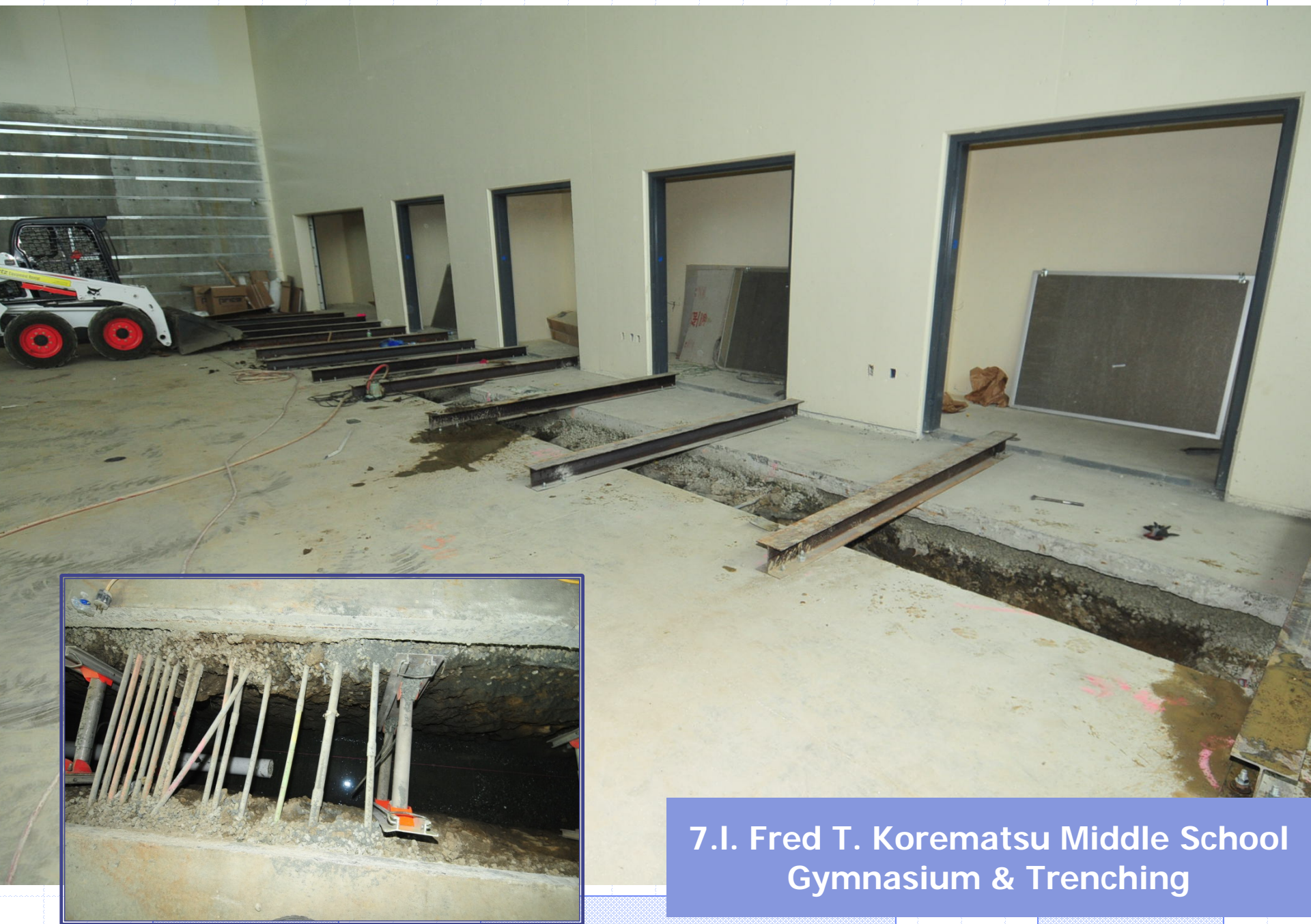
7.I. Fred T. Korematsu Middle School Gymnasium & Trenching