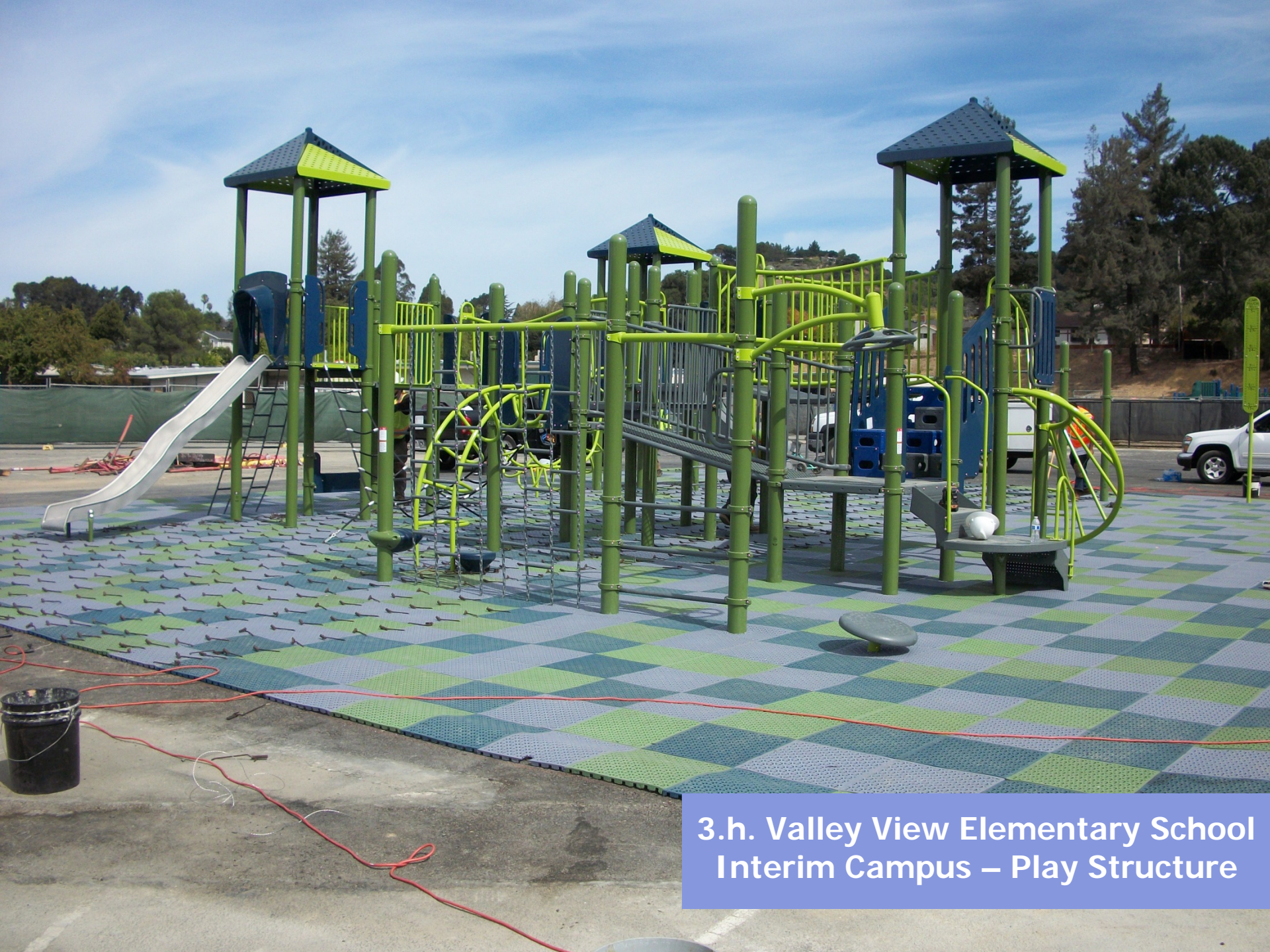
3.h. Valley View Elementary School Interim Campus – Play Structure