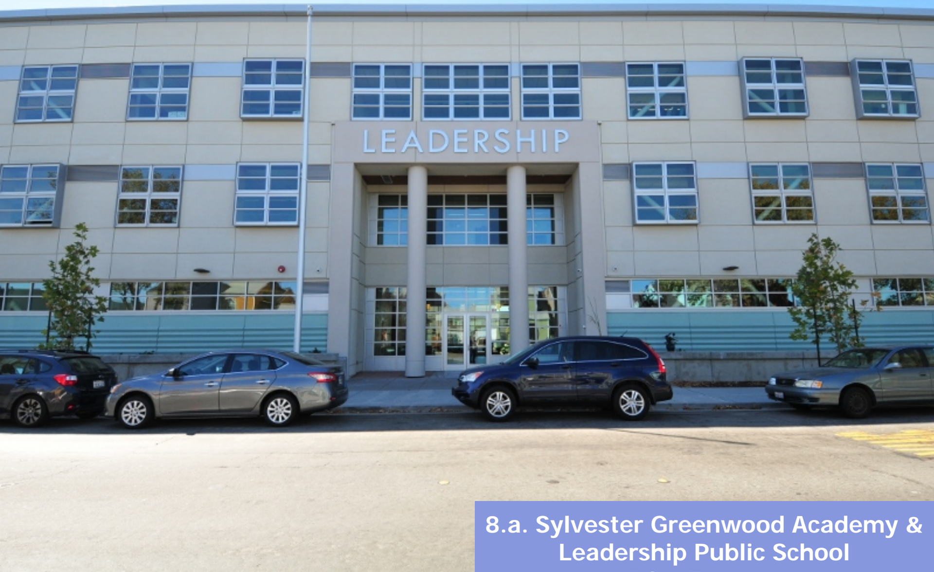
8.a. Sylvester Greenwood Academy & Leadership Public School LPS – Entrance