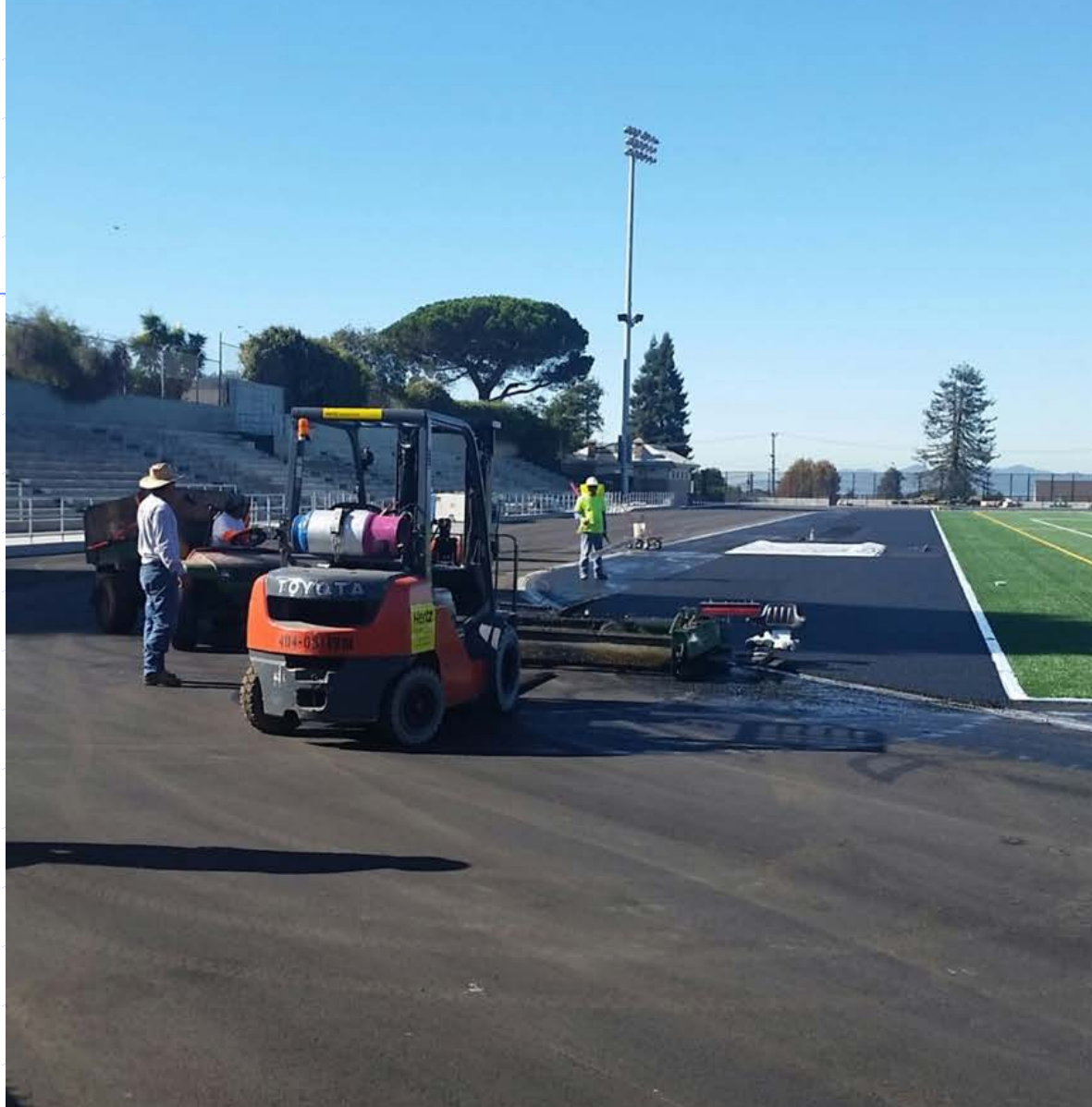
10.d. El Cerrito High School Stadium