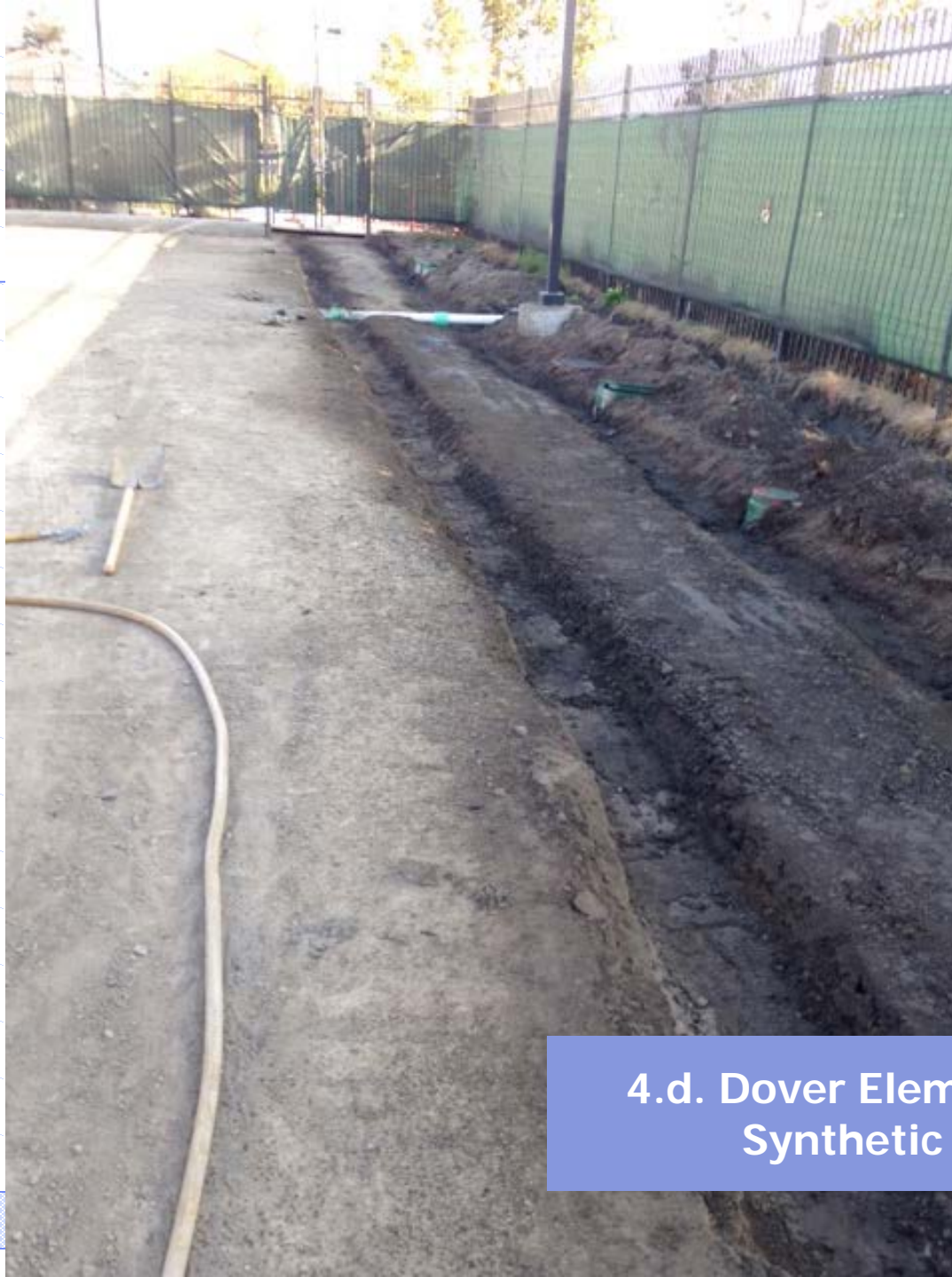
4.d. Dover Elementary School Synthetic Playfield