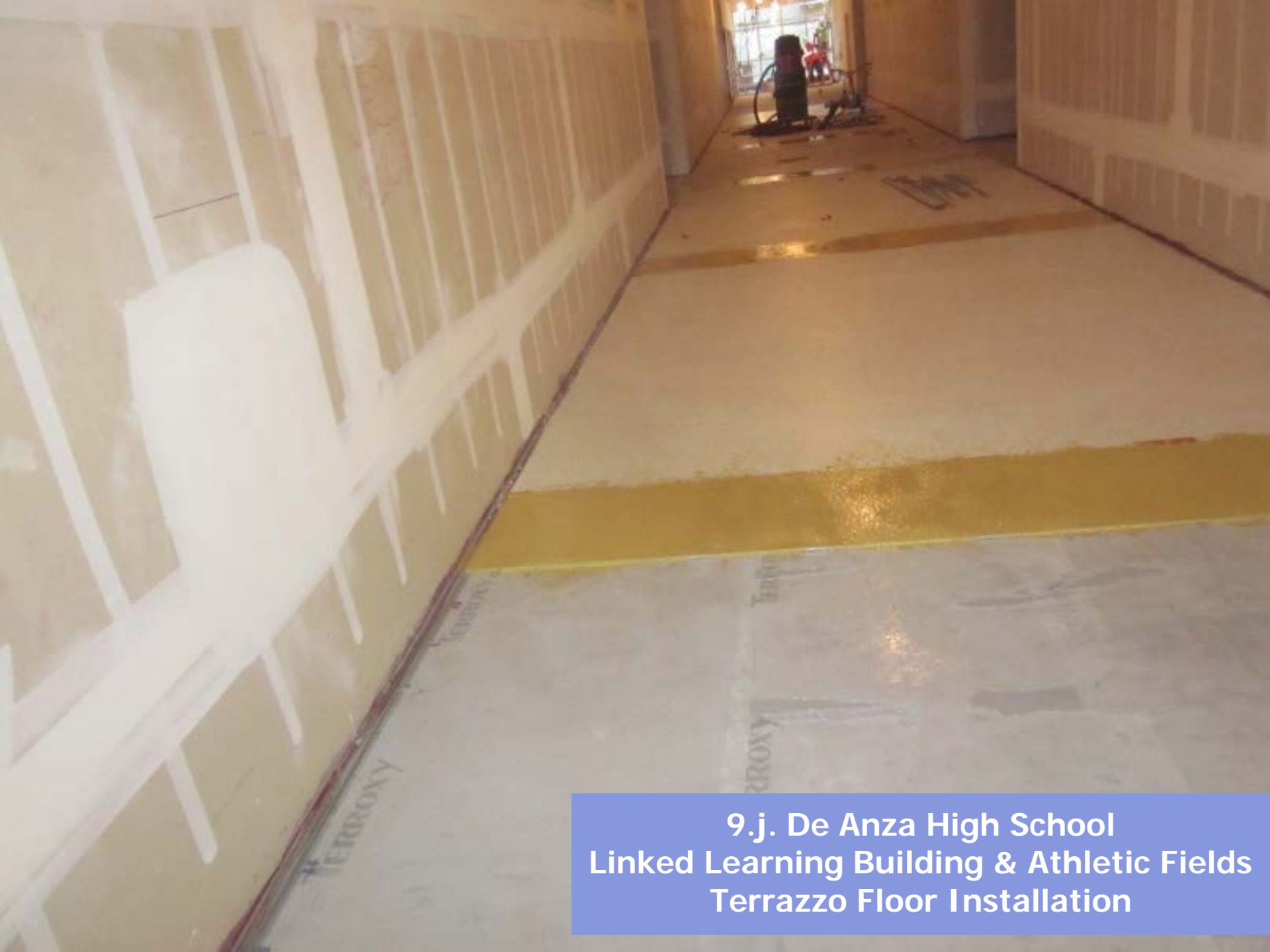
9.j. De Anza High School Linked Learning Building & Athletic Fields Terrazzo Floor Installation