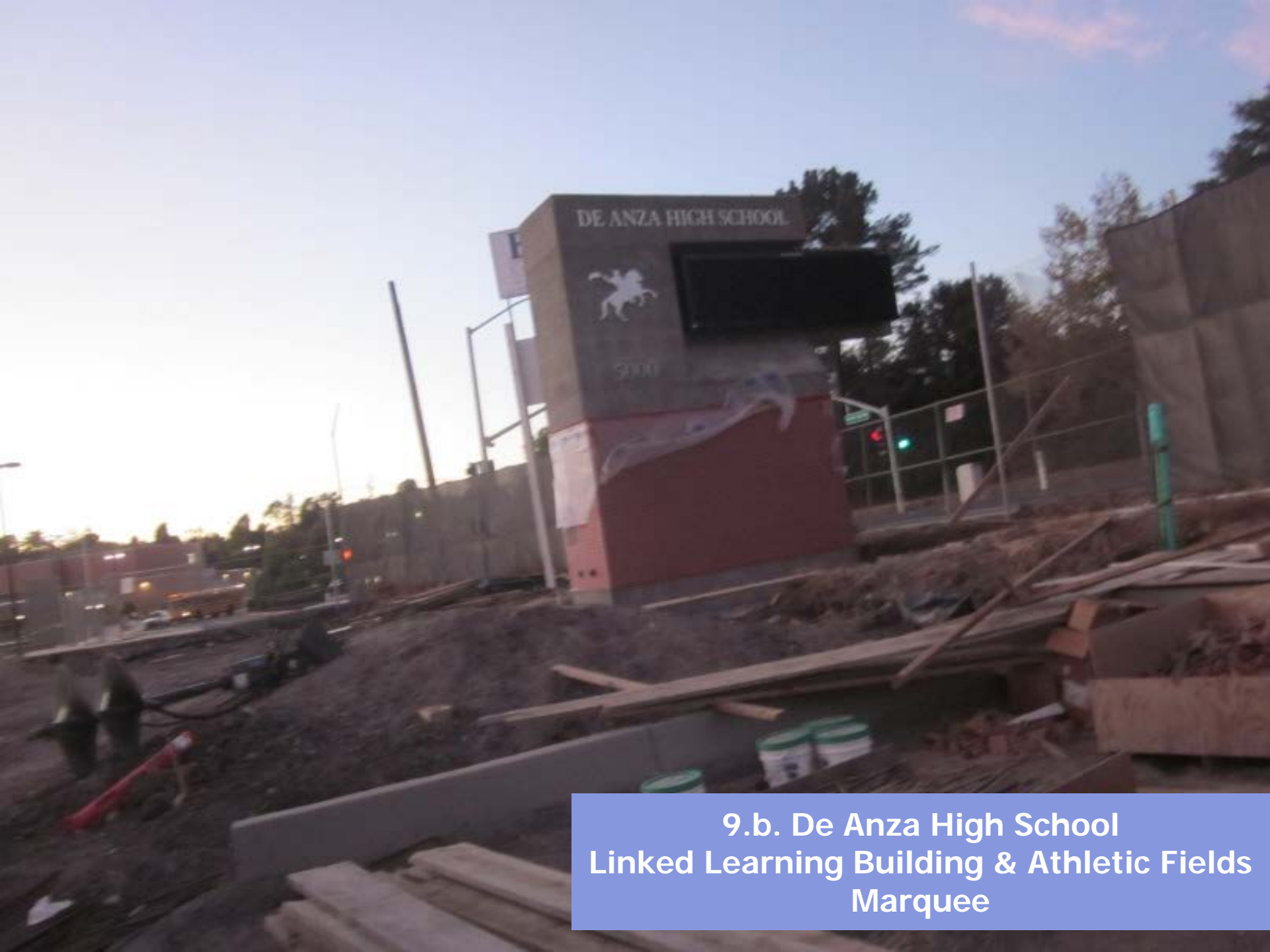
9.b. De Anza High School Linked Learning Building & Athletic Fields Marquee