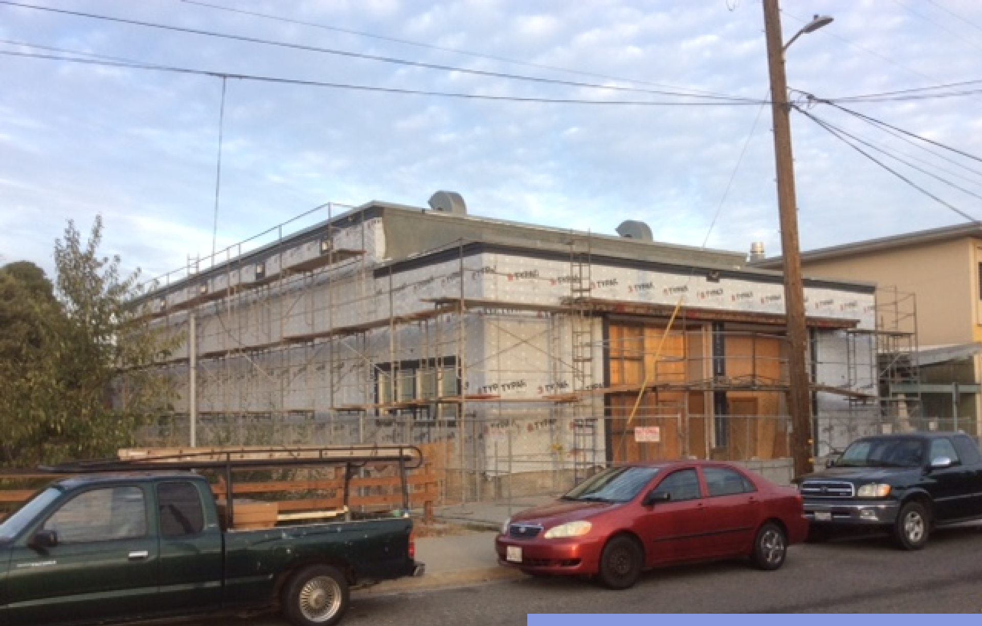
5.b. Lincoln Elementary School Building 'A' Exterior Repairs