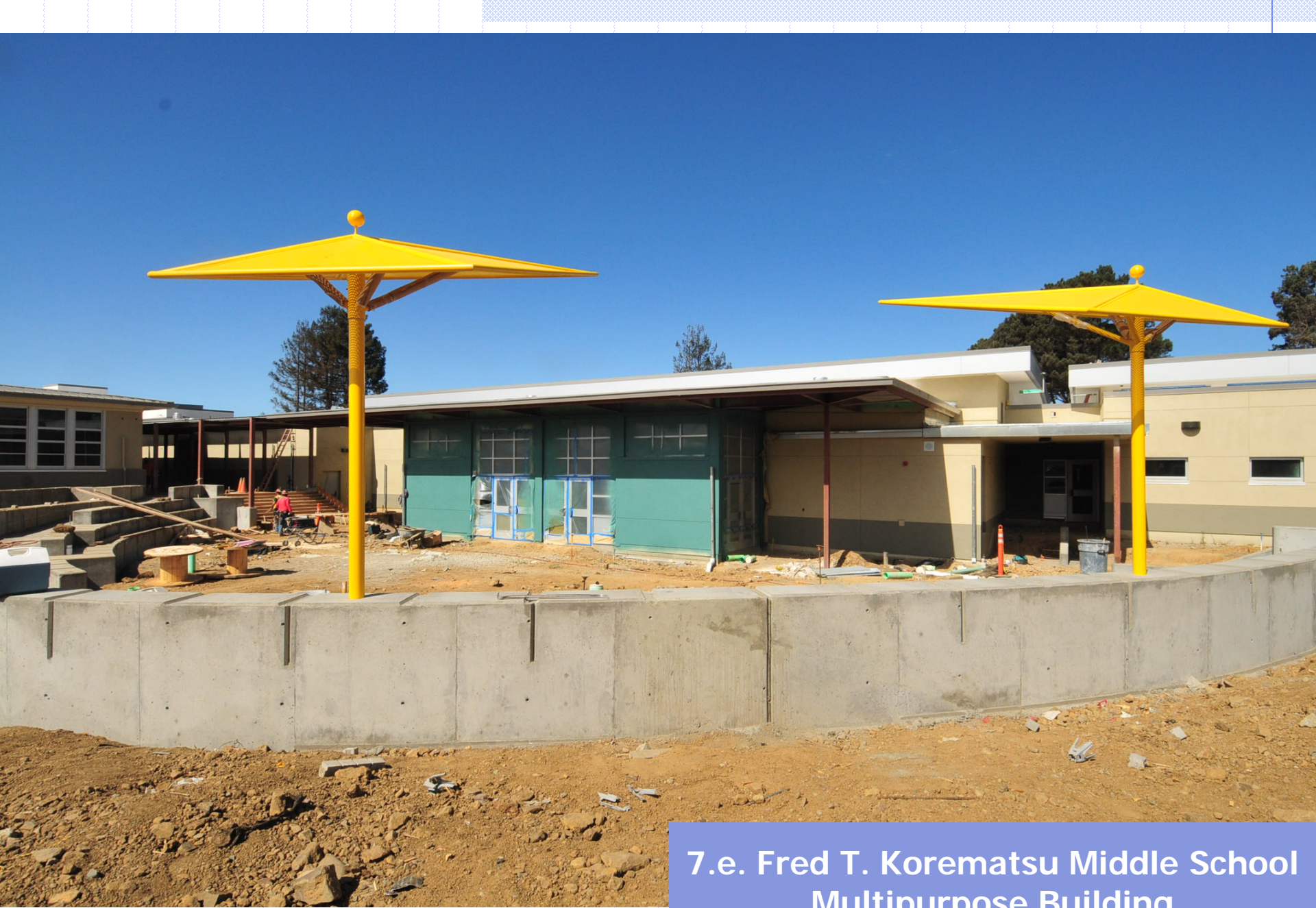
7.e. Fred T. Korematsu Middle School Multipurpose Building