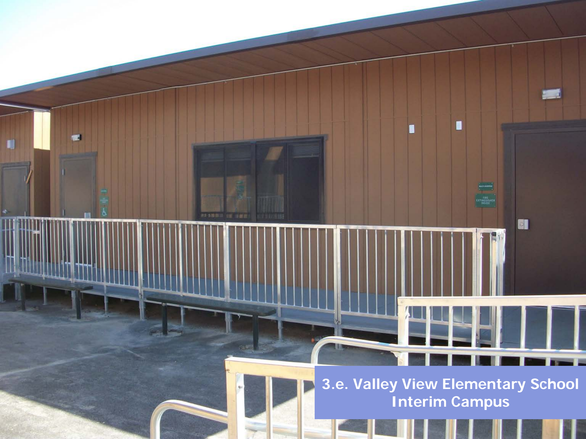
3.e. Valley View Elementary School Interim Campus