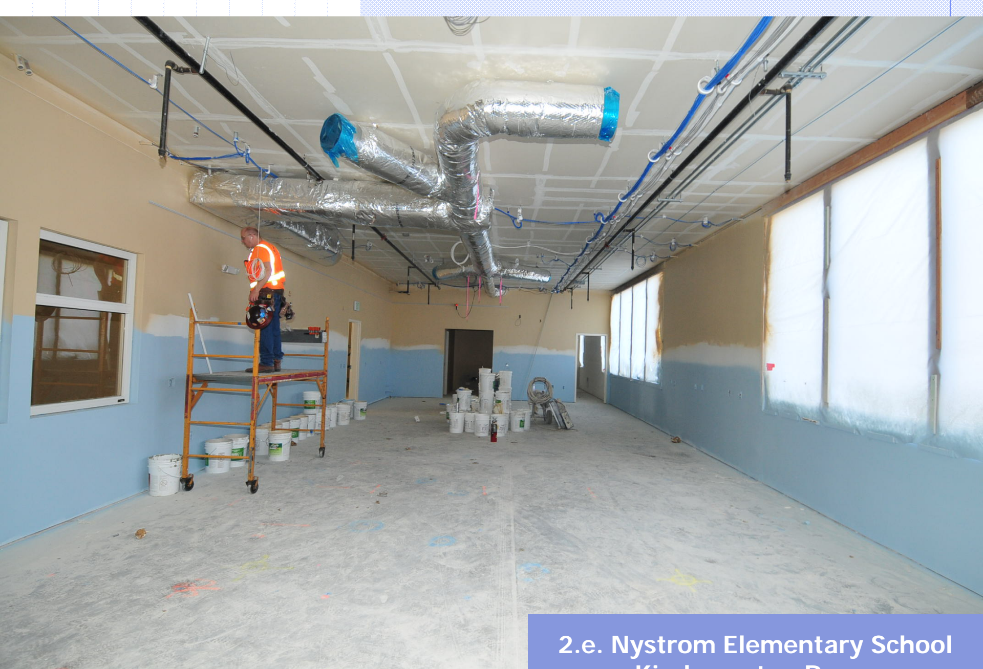
2.e. Nystrom Elementary School Kindergarten Room