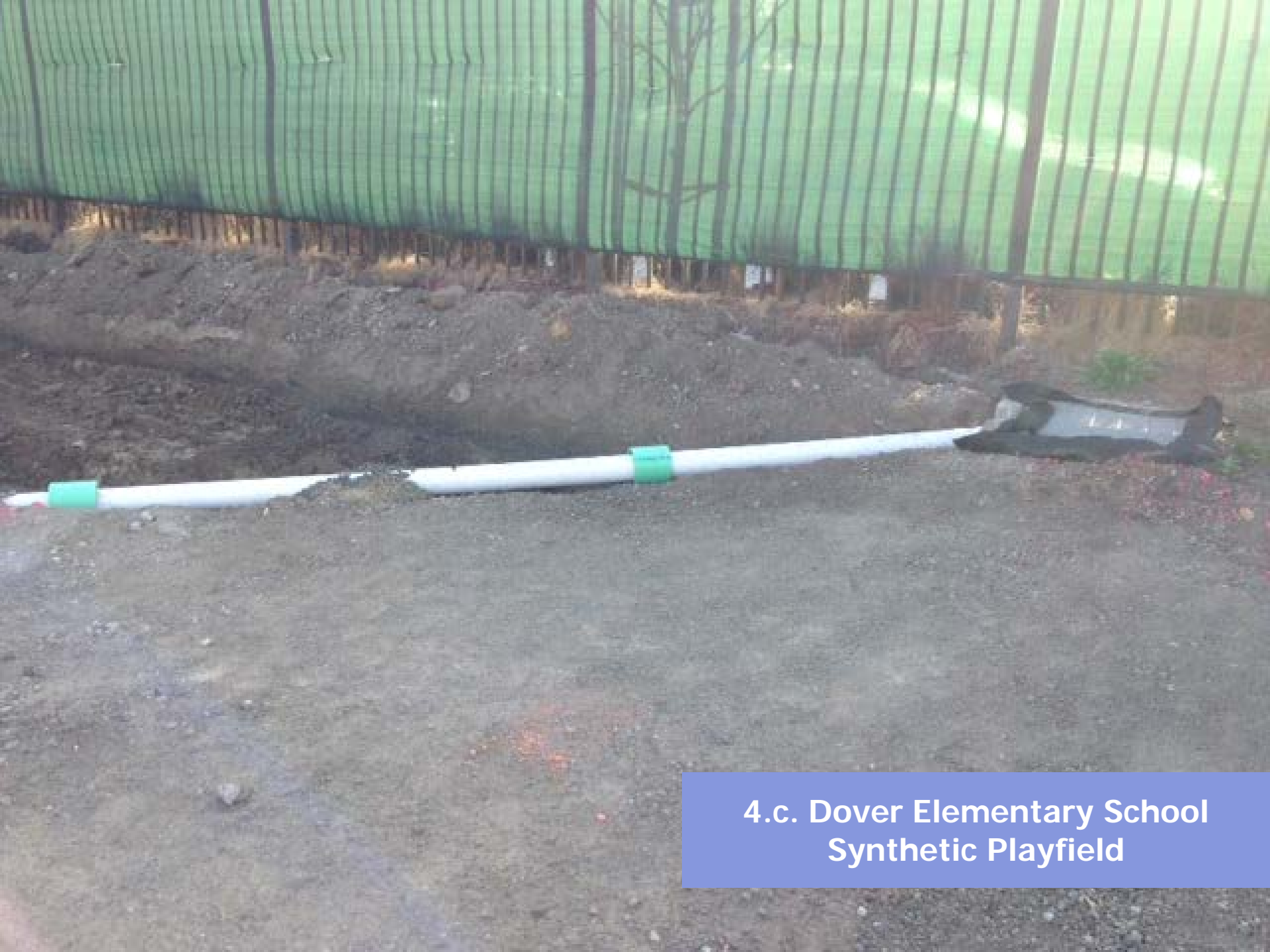
4.c. Dover Elementary School Synthetic Playfield