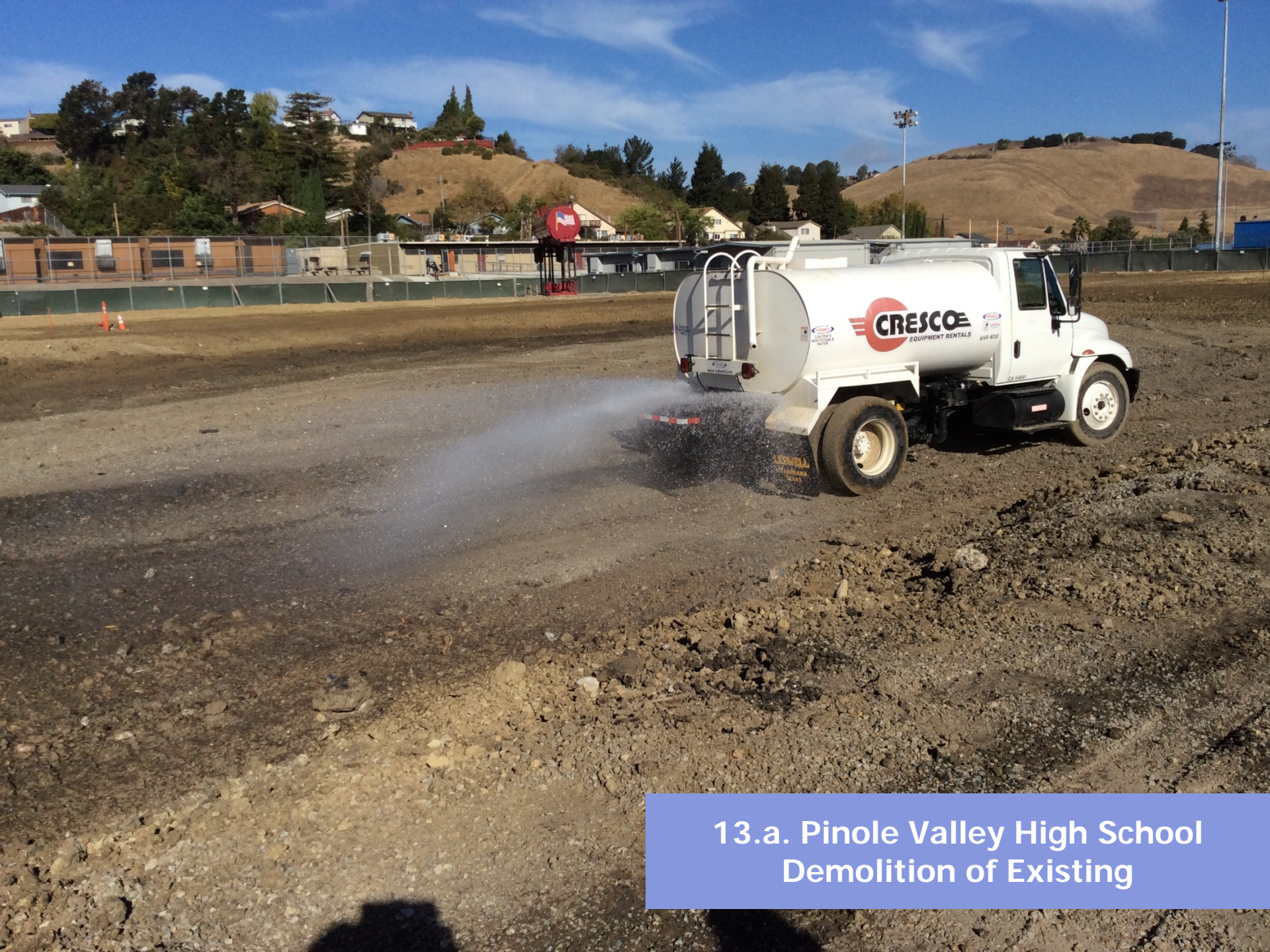
13.a. Pinole Valley High School Demolition of Existing