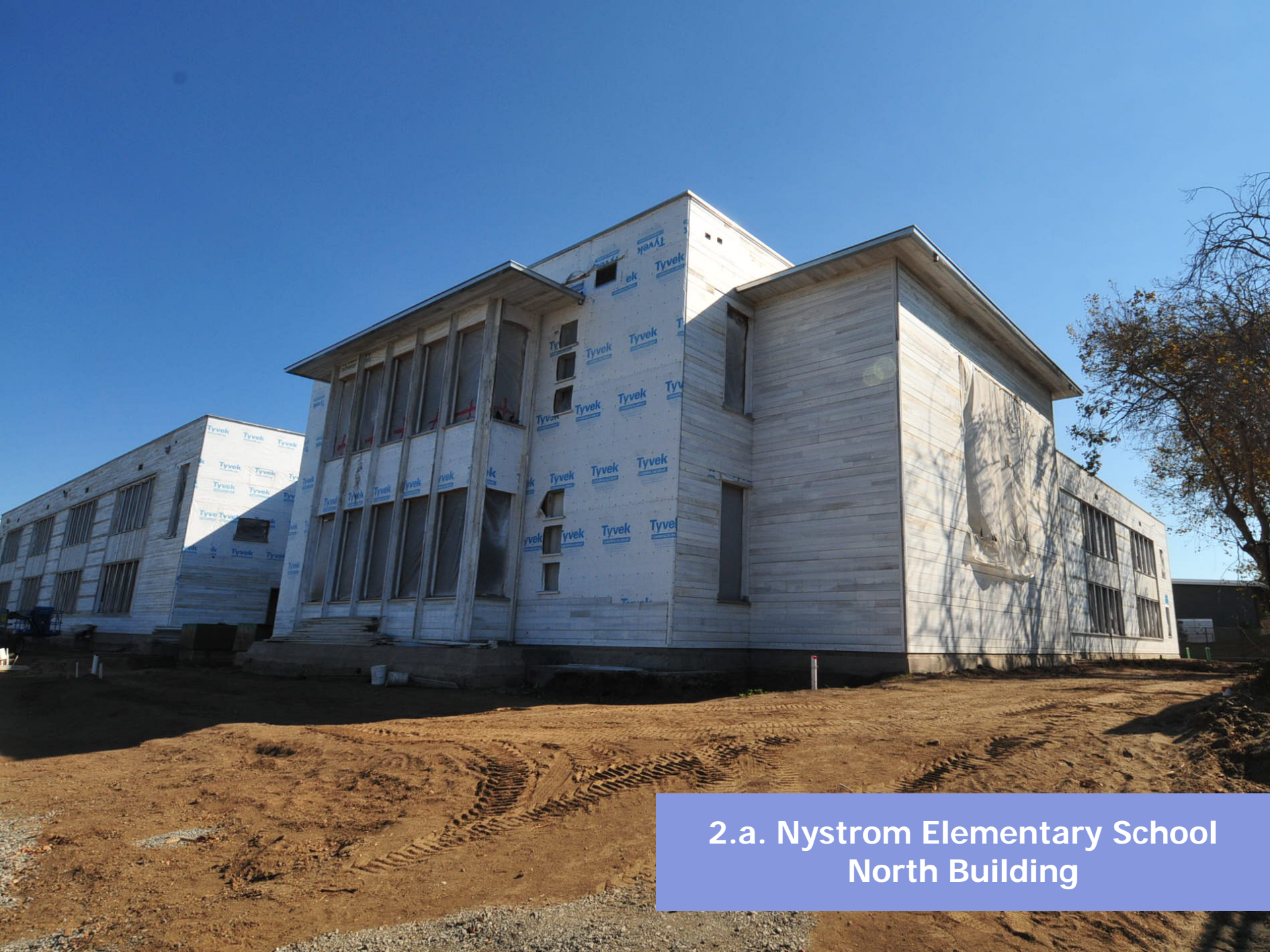
2.a. Nystrom Elementary School North Building