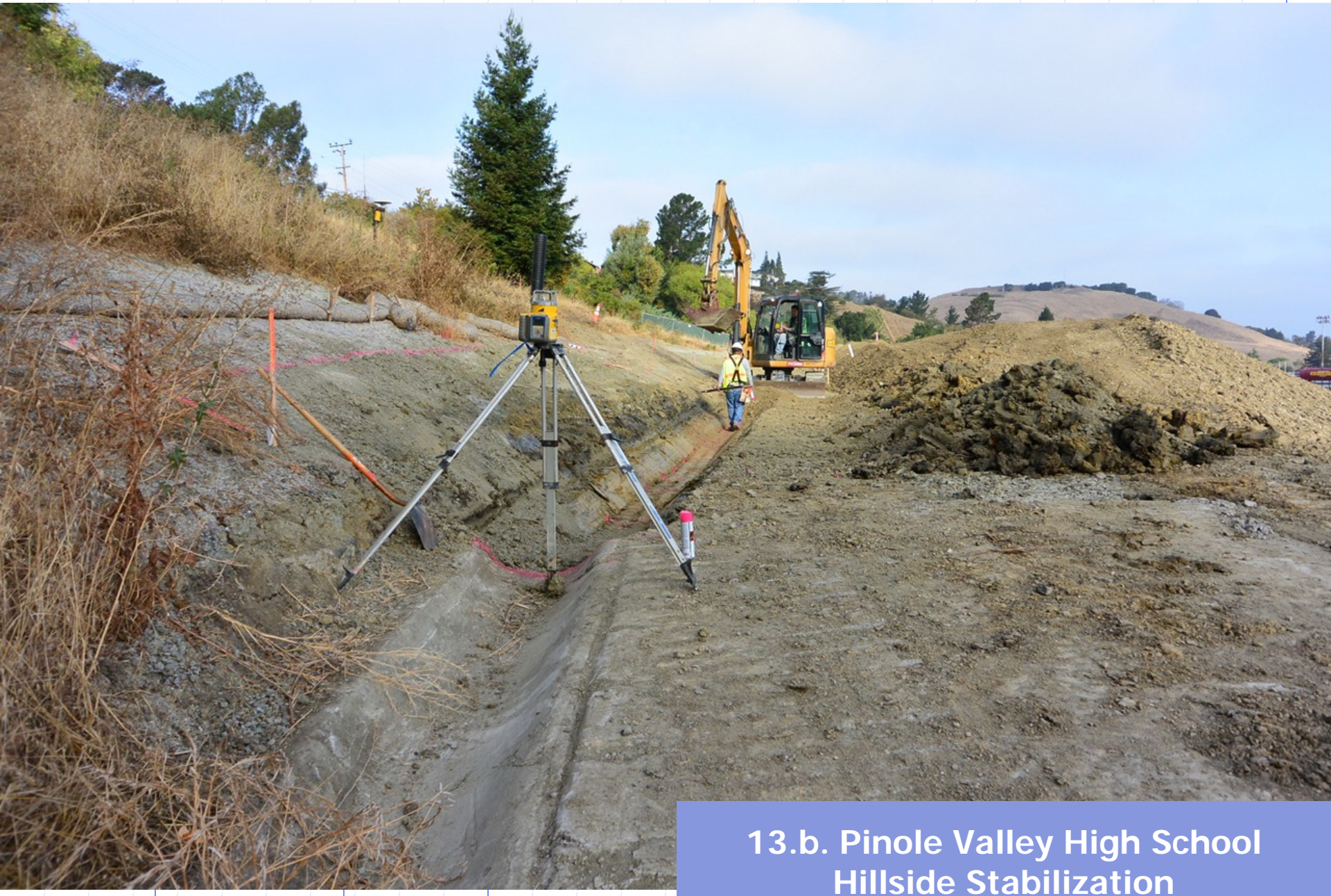
13.b. Pinole Valley High School Hillside Stabilization