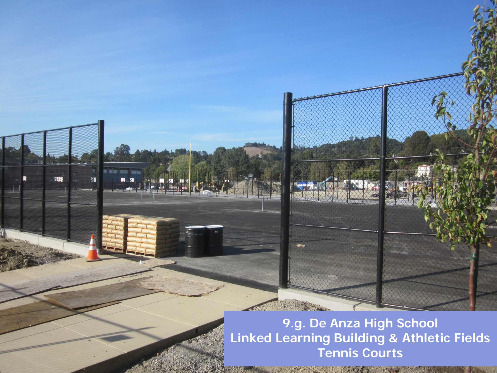
9.g. De Anza High School Linked Learning Building & Athletic Fields Tennis Courts