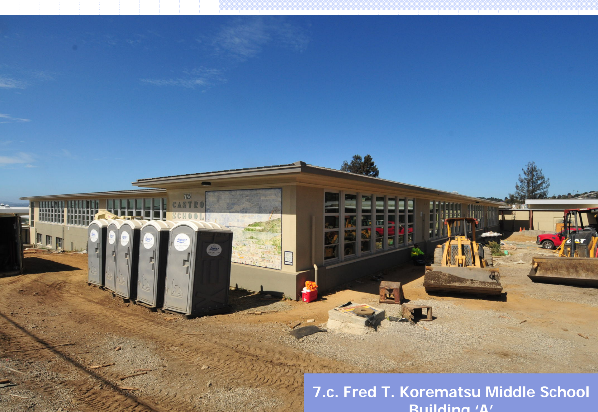
7.c. Fred T. Korematsu Middle School Building 'A'