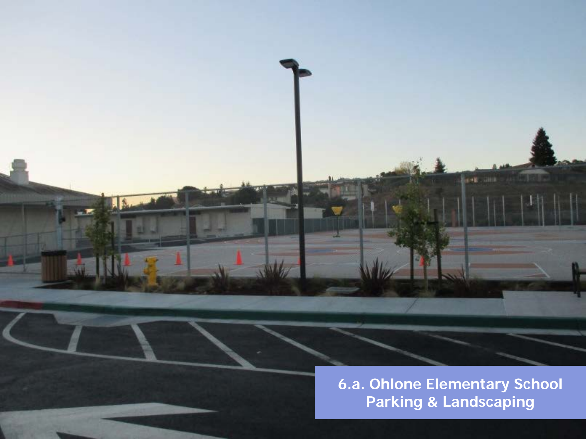
6.a. Ohlone Elementary School Parking & Landscaping