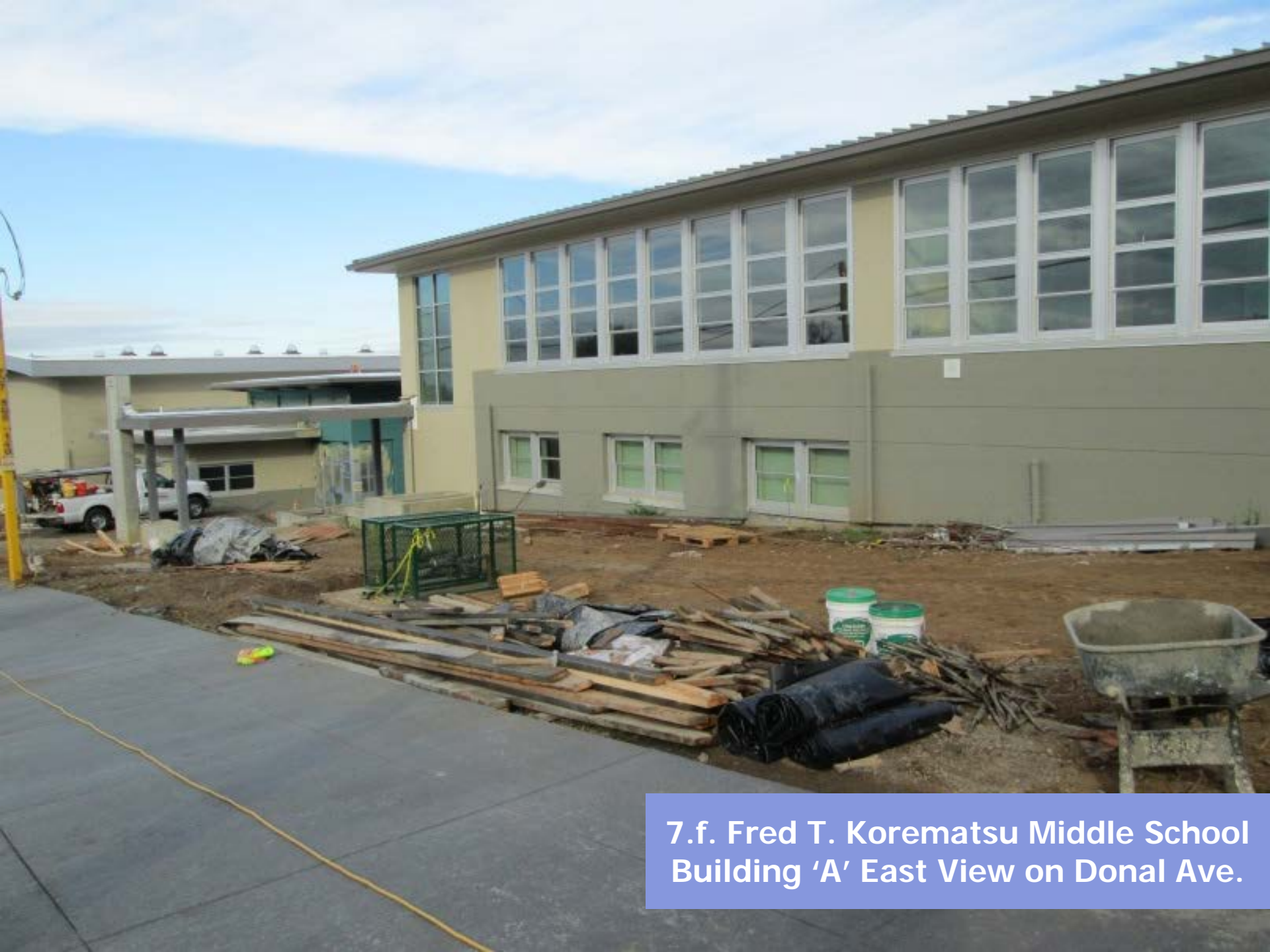
7.f. Fred T. Korematsu Middle School Building 'A' East View on Donal Ave.