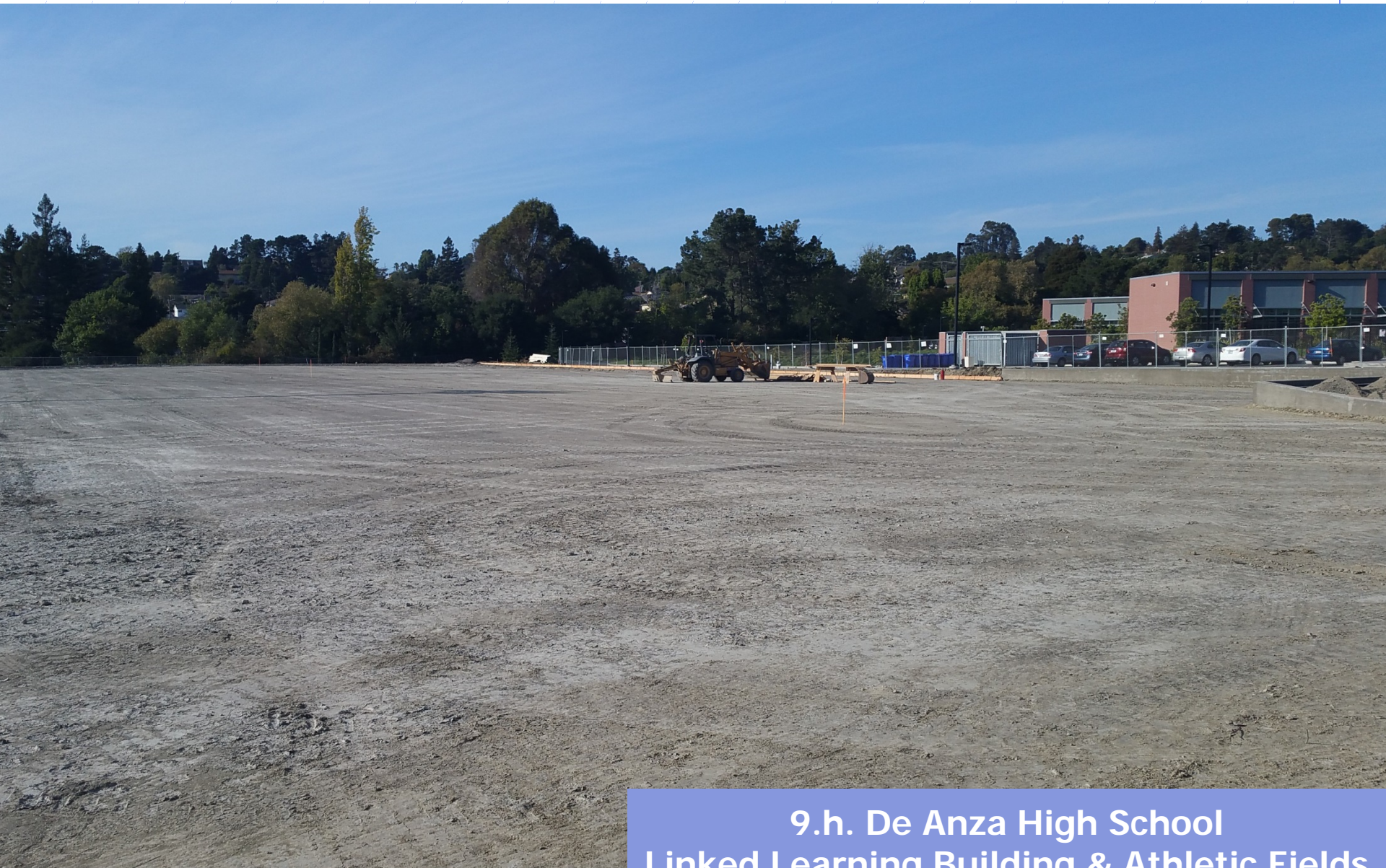
9.h. De Anza High School Linked Learning Building & Athletic Fields Soccer Field