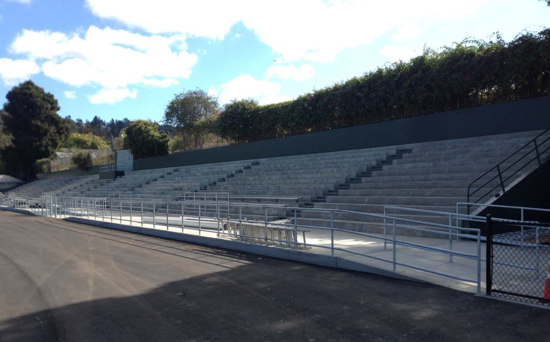
10.c. El Cerrito High School Stadium Bleachers