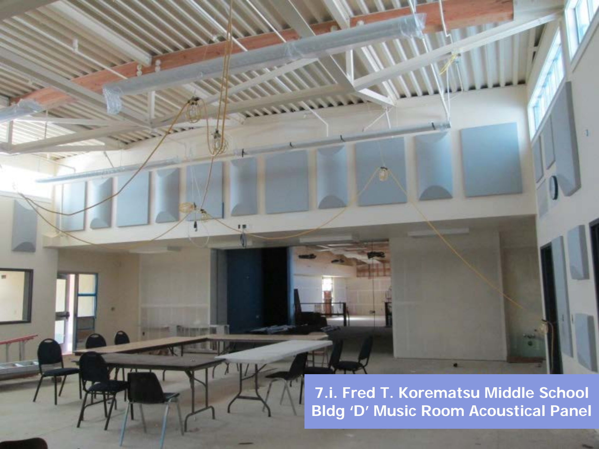
7.i. Fred T. Korematsu Middle School Bldg 'D' Music Room Acoustical Panel