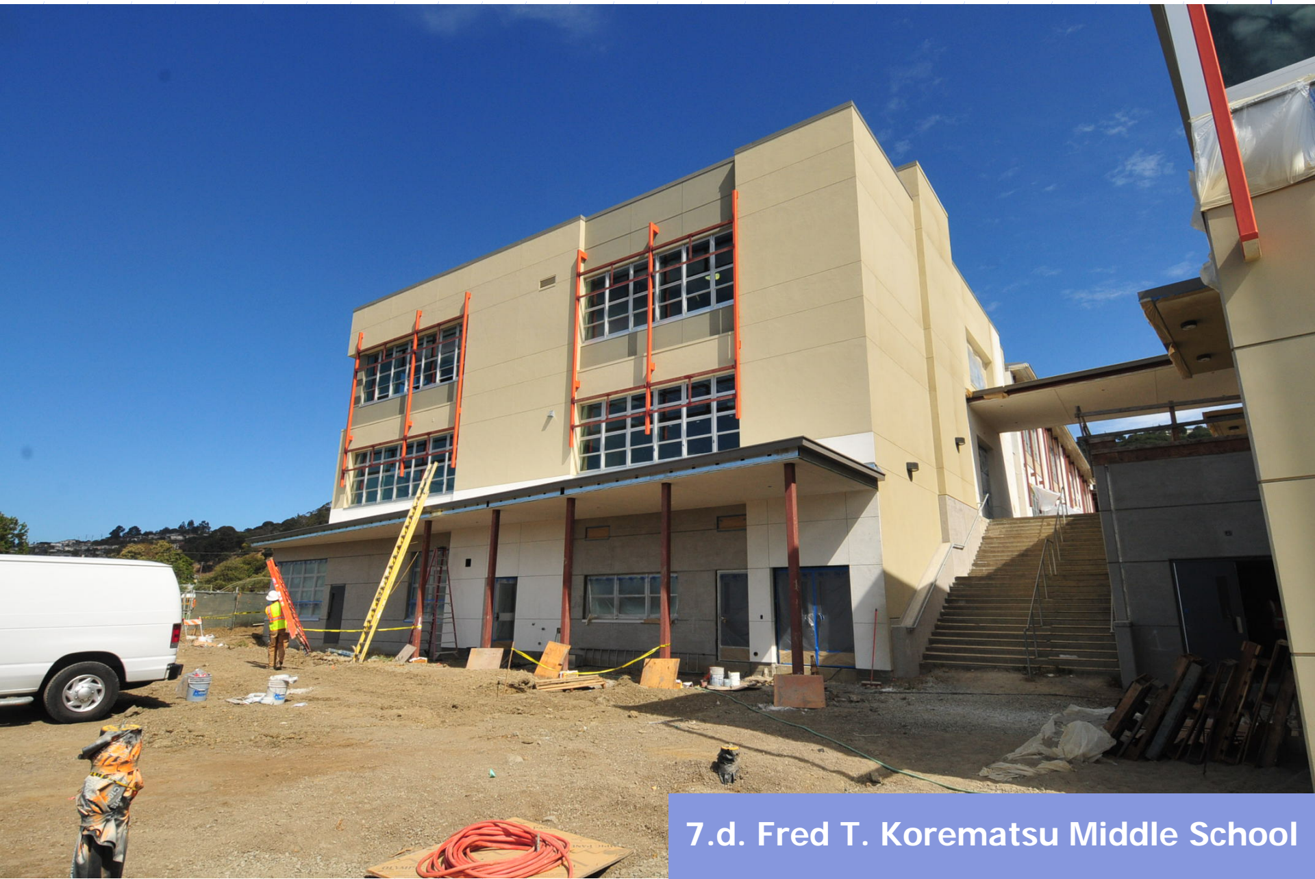
7.d. Fred T. Korematsu Middle School