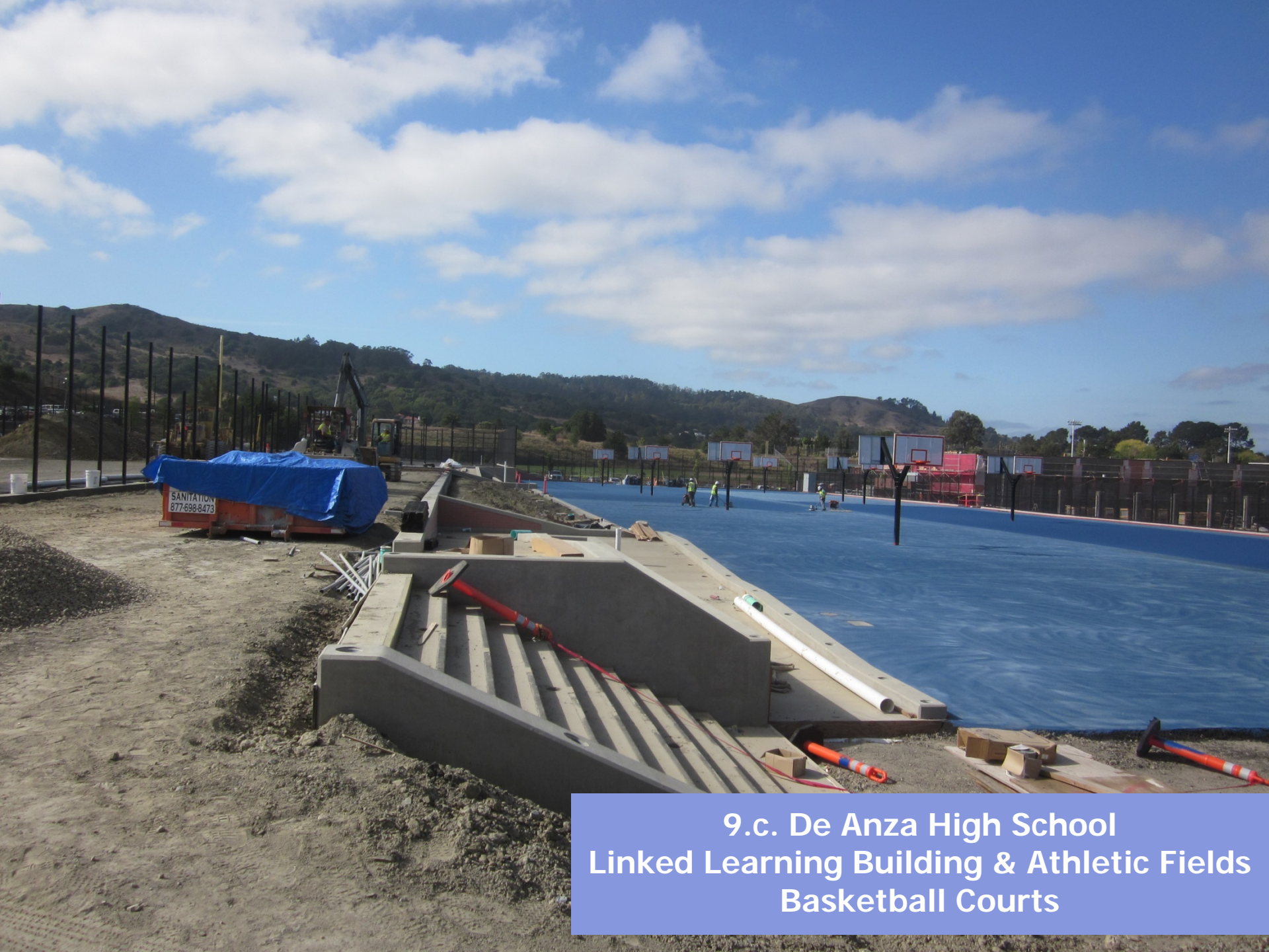
9.c. De Anza High School Linked Learning Building & Athletic Fields Basketball Courts