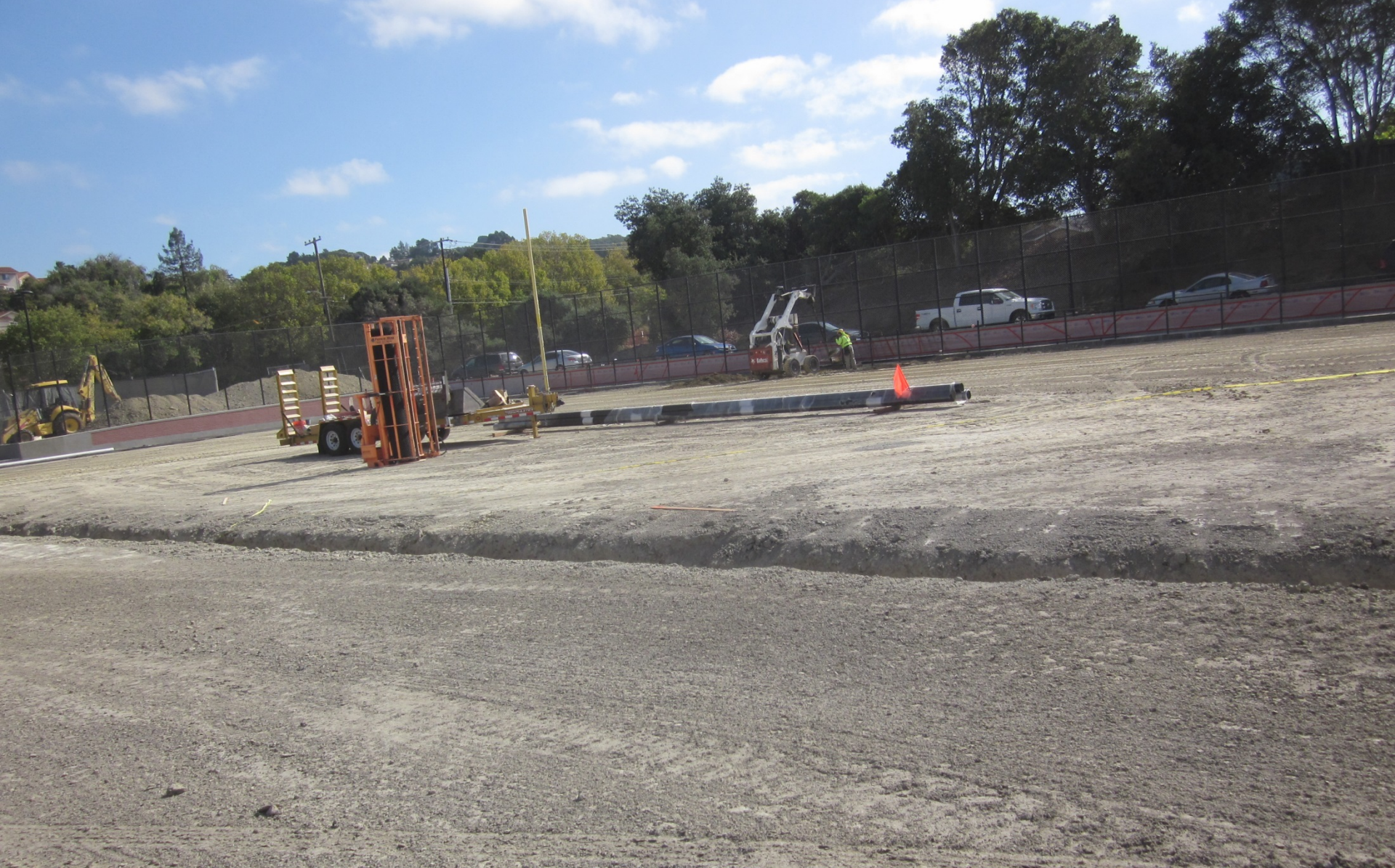
9.f. De Anza High School Linked Learning Building & Athletic Fields Softball Field