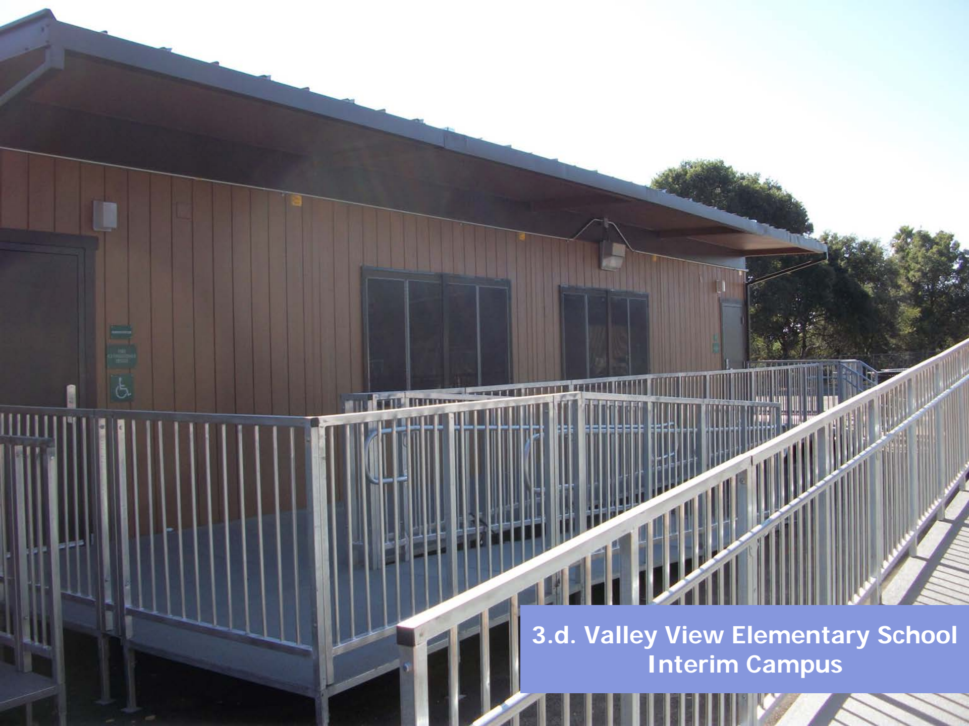
3.d. Valley View Elementary School Interim Campus