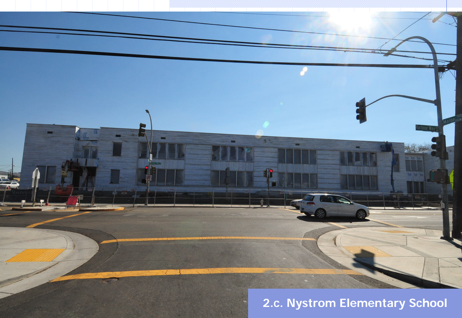
2.c. Nystrom Elementary School