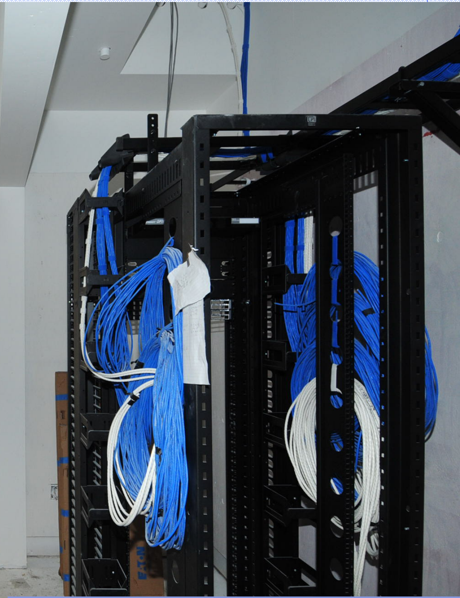
2.f. Nystrom Elementary School IDF Room