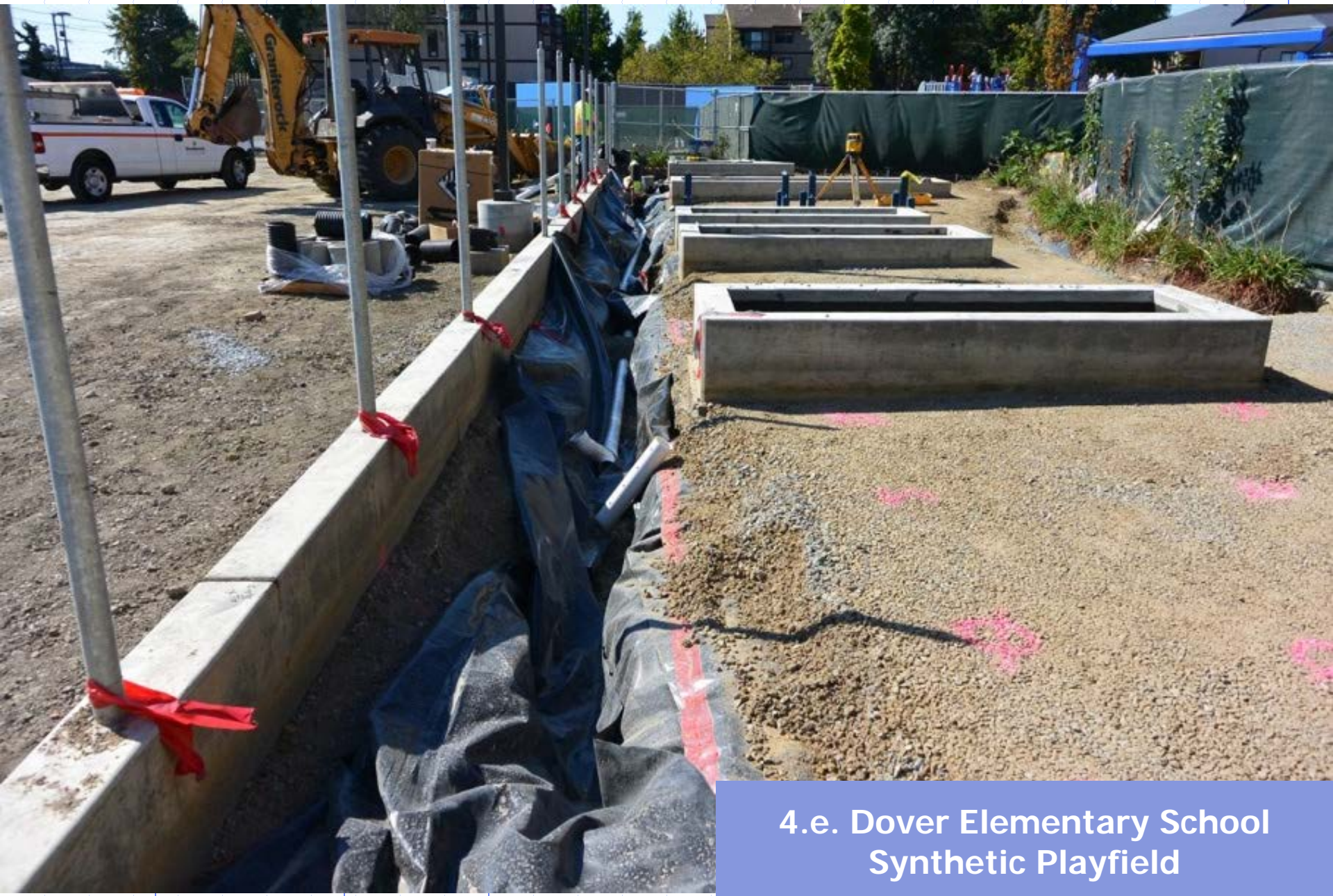
4.e. Dover Elementary School Synthetic Playfield