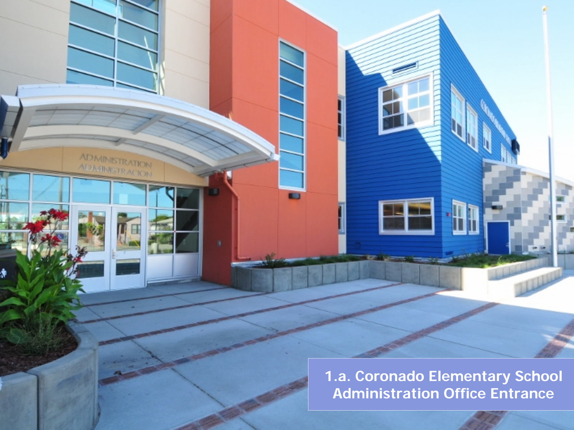
1.a. Coronado Elementary School Administration Office Entrance