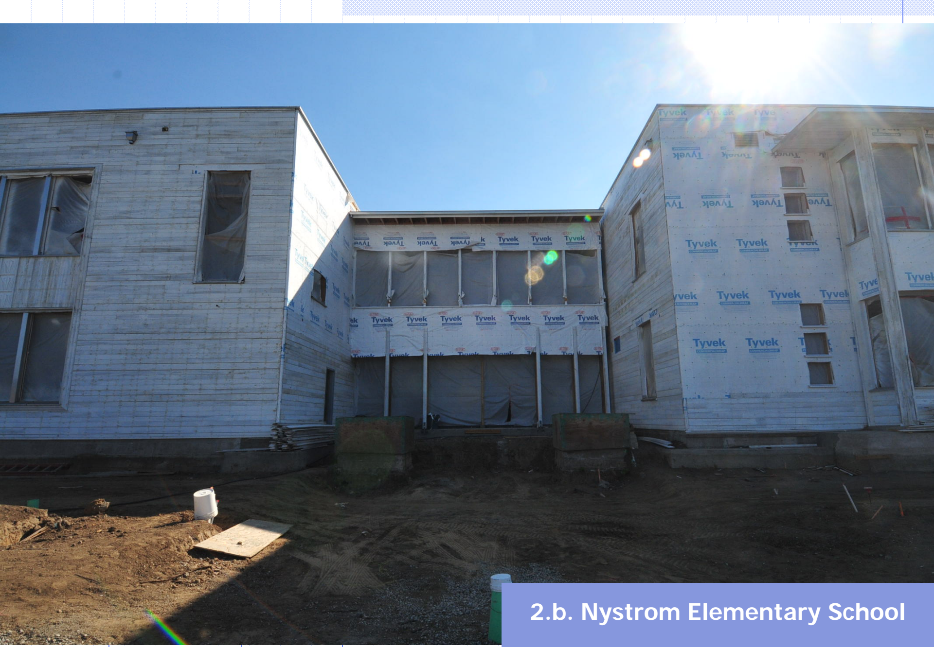
2.b. Nystrom Elementary School