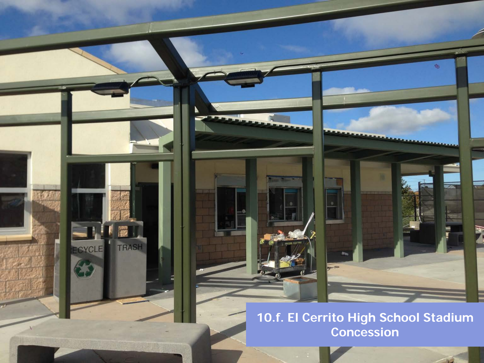
10.f. El Cerrito High School Stadium Concession