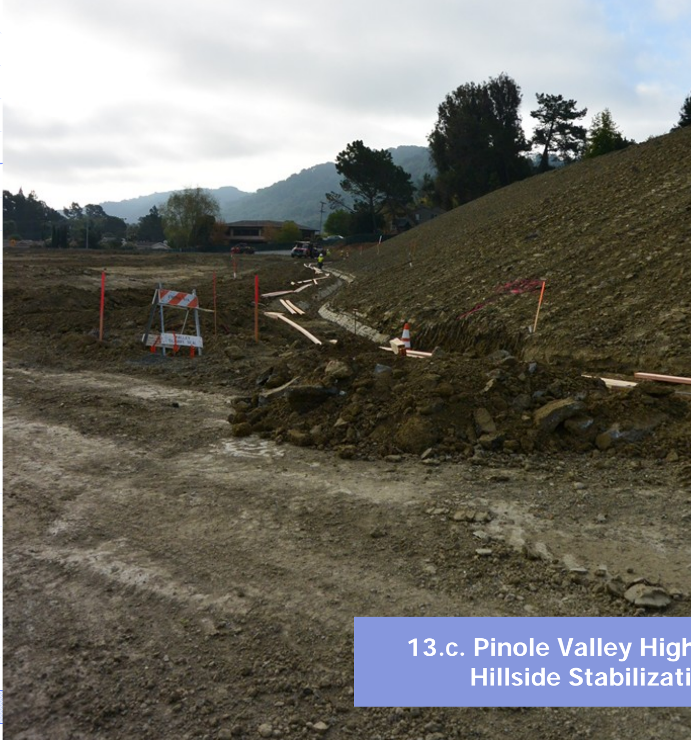
13.c. Pinole Valley High School Hillside Stabilization