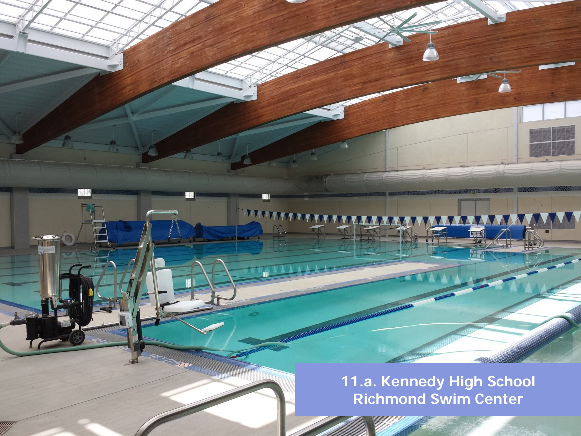
11.a. Kennedy High School Richmond Swim Center