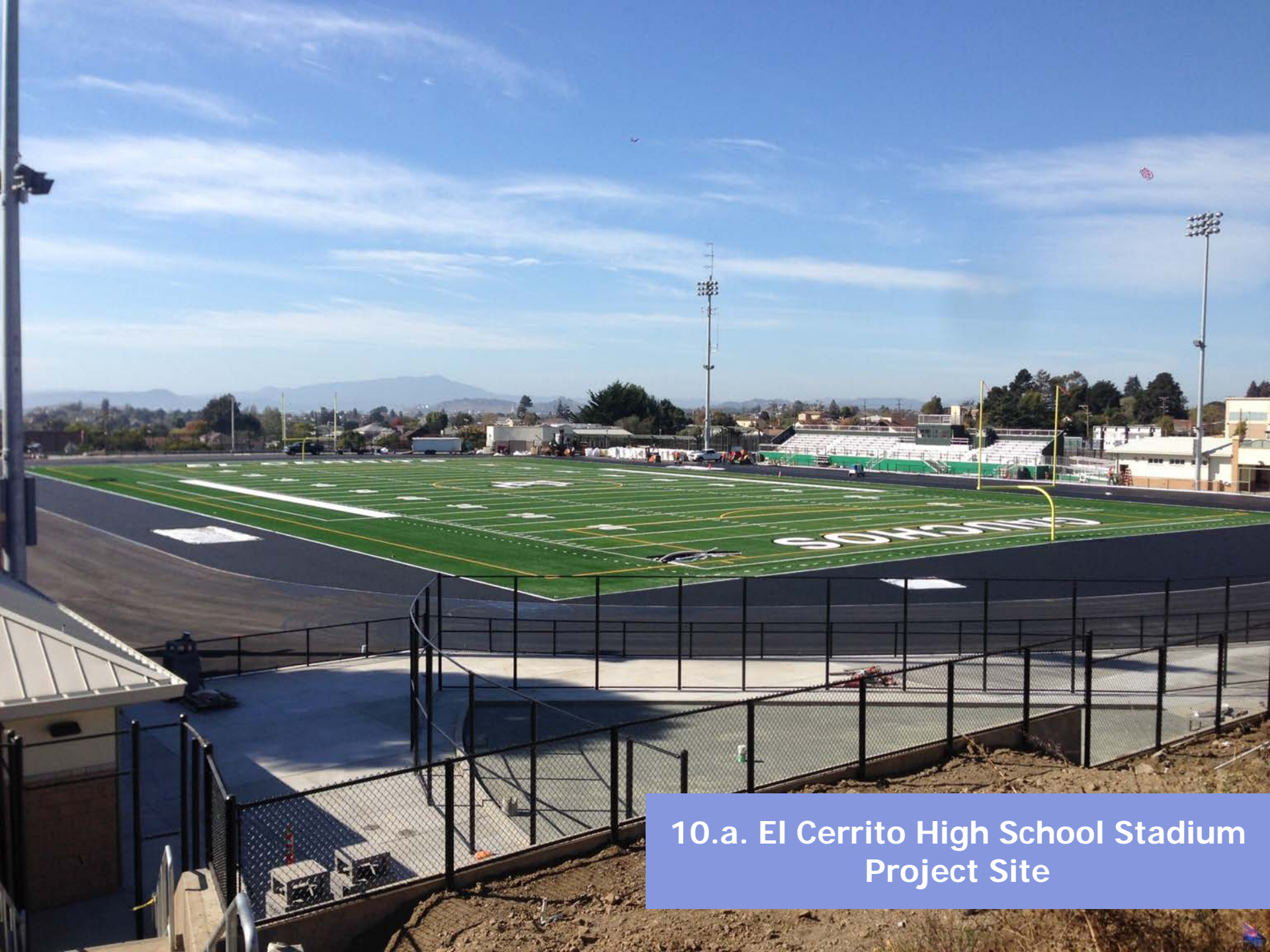
10.a. El Cerrito High School Stadium Project Site